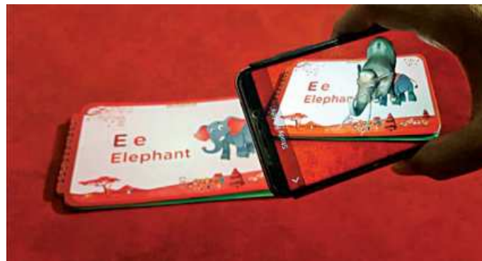
Study Buddy developed an application that creates augmented reality, motivating students to read and learn.

The Study Buddy app can be downloaded from https://play.google.com/store/apps/details?id=com.inzamam.engn.slidingtab&fbclid=IwAR2BdVcxmmu6VwKyW3M3jJE0ZhXjEk4-qW67tjprxAUmDEv56ur-18gxR20 .