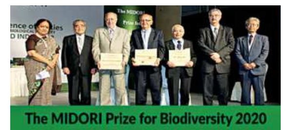
The MIDORI Prize for Biodiversity 2020