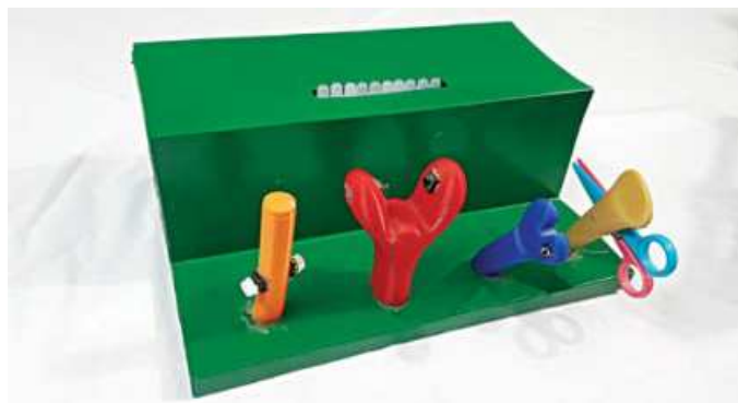
A device by Study Buddy through which differently abled children can learn four different motor skills.

learning and reading, which leads to them dropping out of their education before high school, and even entails risks of unemployment and loss of jobs later in life.