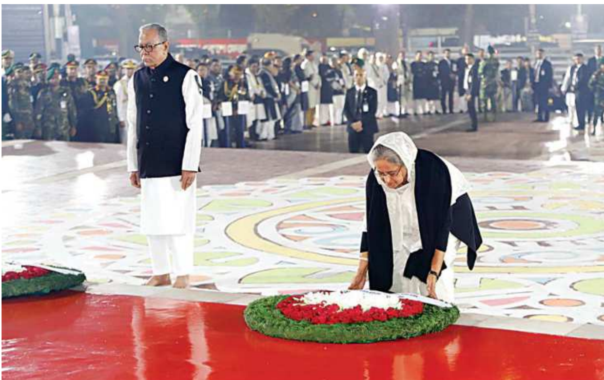
President Abdul Hamid and Prime Minister Sheikh Hasina paying homage to the Language Movement martyrs at the Central Shaheed Minar early today. People across the country will observe the International Mother Language Day and commemorate the martyrs today.