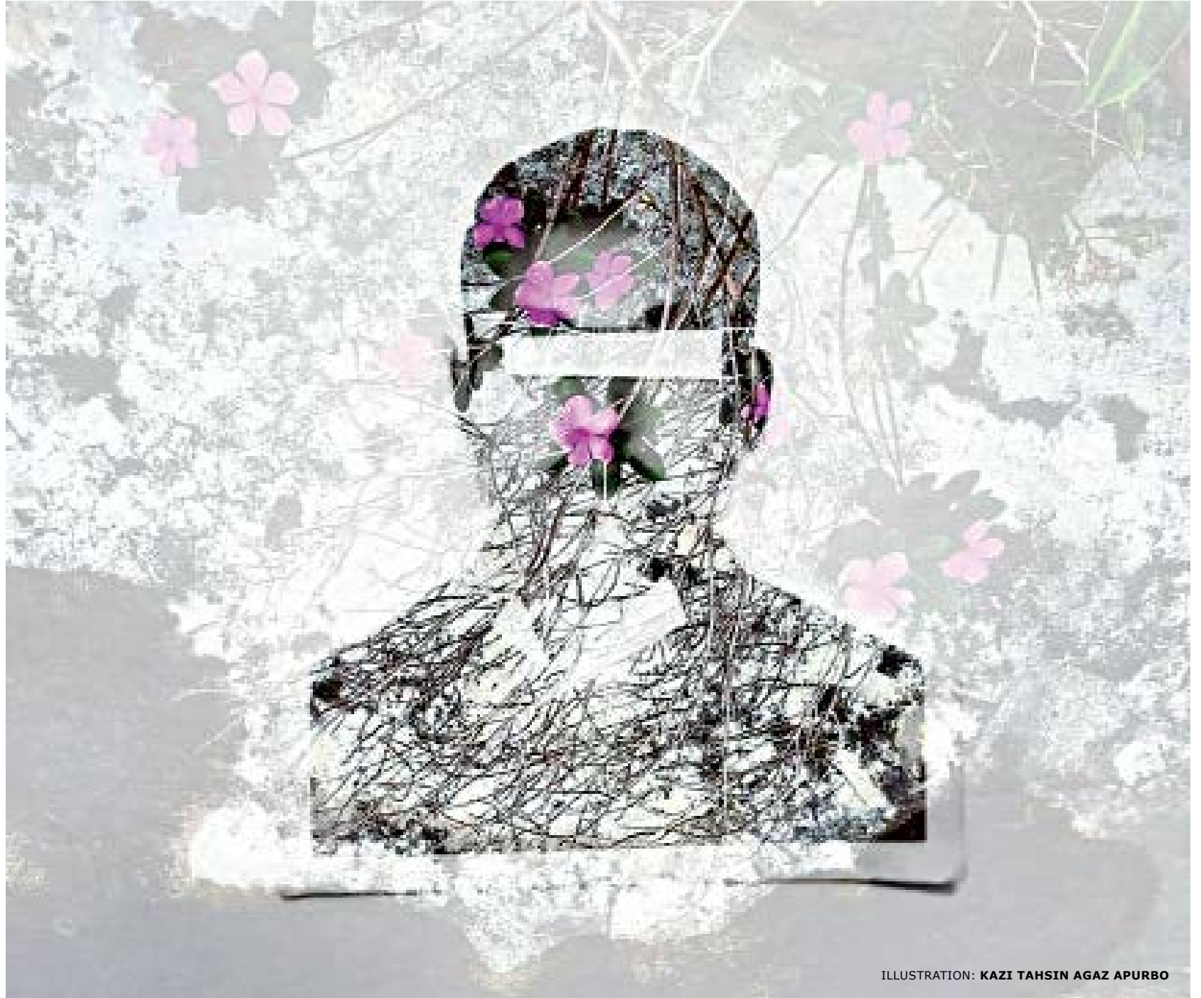
ILLUSTRATION: KAZI TAHSIN AGAZ APURBO

"EXCELLENCE IS A CONTINUOUS PROCESS AND NOT AN ACCIDENT"