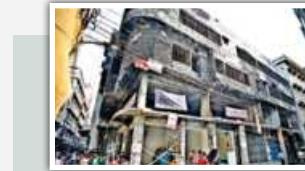
Haji Wahed Mansion now

Traders relocated some chemical warehouses to other parts of the city on their own.