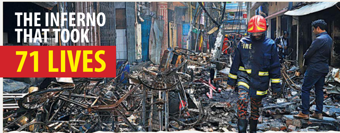
THE INFERNO THAT TOOK 71 LIVES

On the night of Feb 20, 2019, Old Dhaka experienced one of the deadliest fire incidents in the country's history. The blaze originated from Haji Wahed Mansion at Chawkbazar before spreading to five buildings like wildfire. Firefighters took 14 hours to douse the fire.