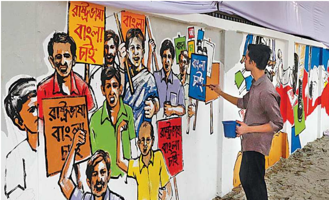
A fine arts student painting a language movement-themed graffiti on a wall of Central Shaheed Minar at Dhaka University yesterday. Preparations for February 21 are being made across the country.