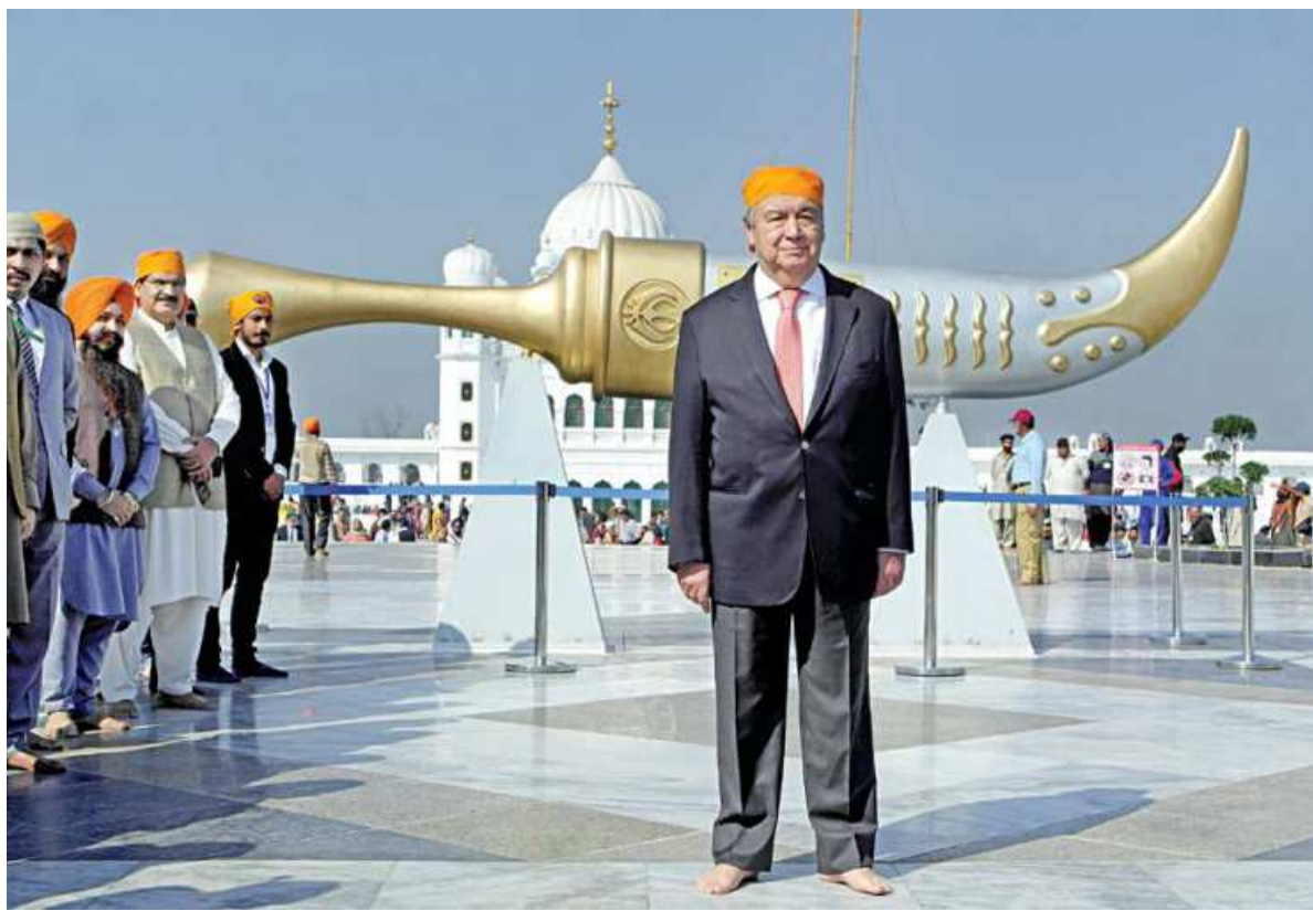
United Nations Secretary-General Antonio Guterres poses for a photograph while visiting the holy Sikh temple Gurdwara Darbar Sahib in Kartarpur, Pakistan, yesterday.