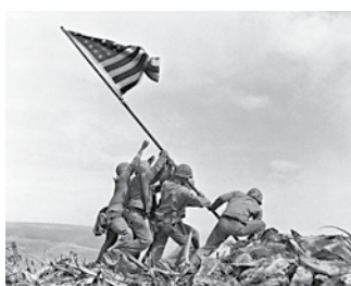
February 19, 1945 Iwo Jima invaded by US Marines

In 1945, during the final phases of World War II, US Marines invaded Iwo Jima so as to wrest control of the strategically important island from the Japanese, who put up fierce resistance in the ensuing battle.