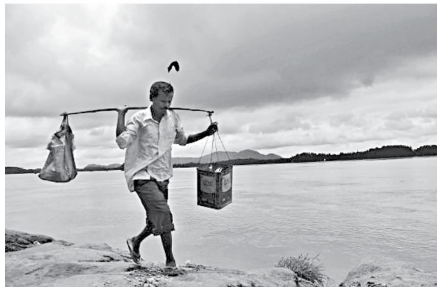
A fish vendor approaches the Brahmaputra river to rinse his containers as rain clouds loom over Guwahati on June 17, 2016.

The first issue of climate change is already high on our national agenda and with the soon to be published revised Bangladesh Climate Change Strategy and Action Plan (BCCSAP) that will take us to 2030, we will have a blueprint for what needs to be done in order to transform Bangladesh from being one of the world's most climate