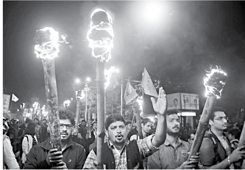
Members of various student groups took part in a torch rally in Kolkata to protest against India's new citizenship law.

In particular, a series of decisions suggests the depth of the alienation, stoked by BJP policies and attitudes, of India's 180-million strong Muslim population. In recent years, the BJP has criminalised an Islamic form of divorce,