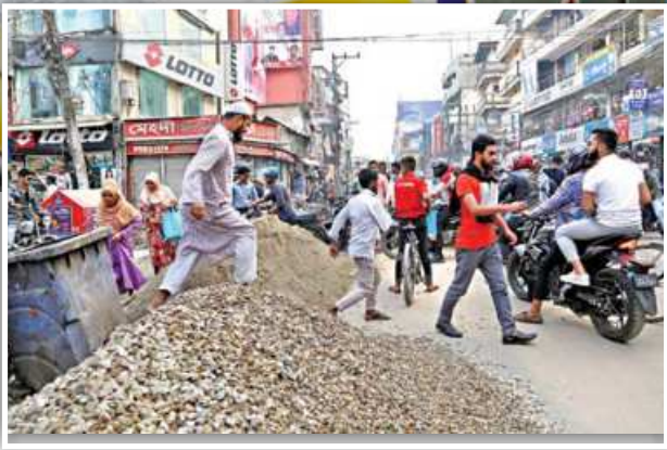
GROWING PAINS... Pedestrians and vehicles alike have to zigzag through this road in Sylhet city's Zindabazar area due to "unannounced and unfinished" development work. According to locals, the city corporation shut down the busy road from East Zindabazar to Barutkhana to repair a box culvert. The work is not only affecting commuters but also businesses in the area, as the authorities did not arrange any alternative option for them. The photos were taken on Monday.