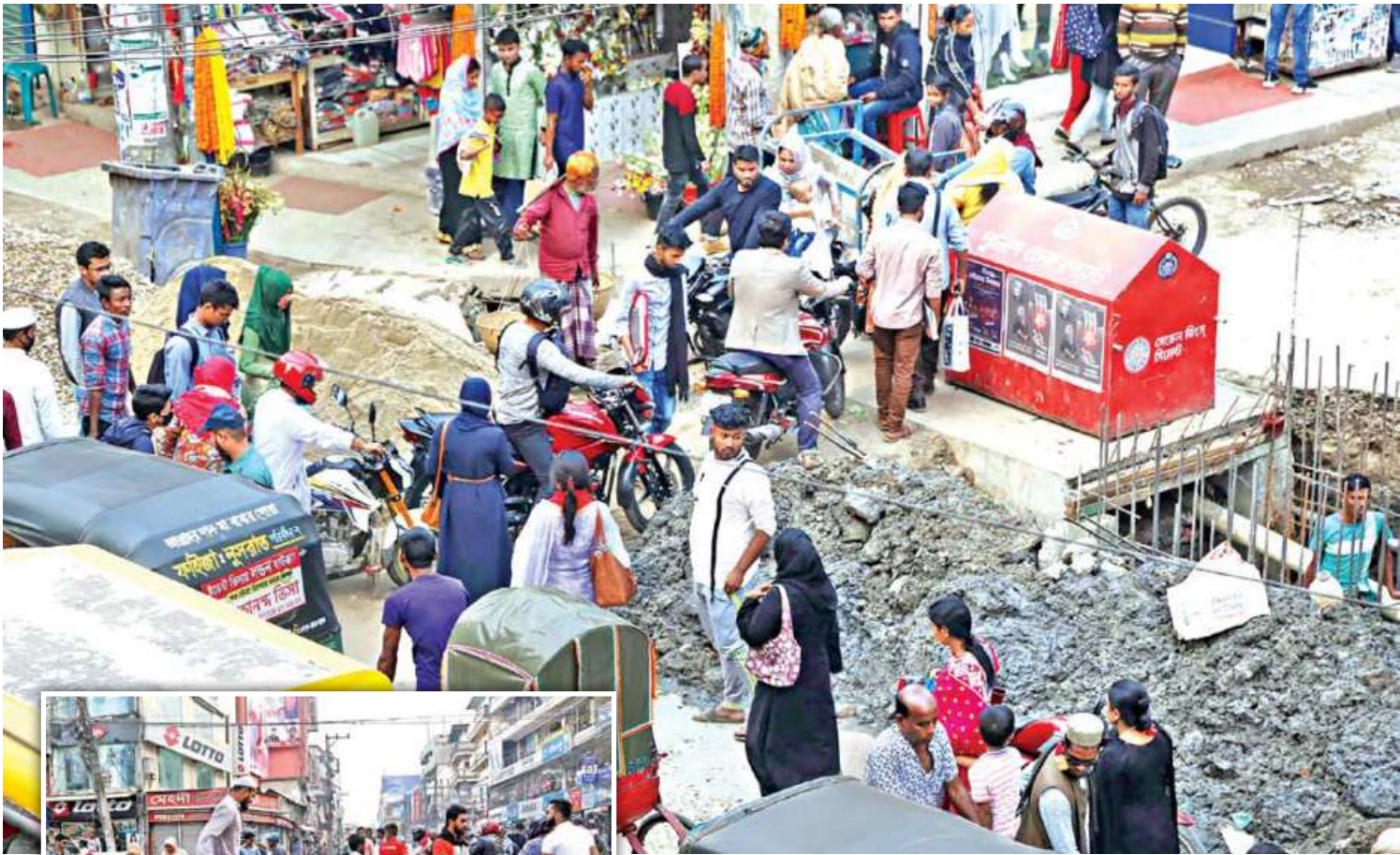
GROWING PAINS... Pedestrians and vehicles alike have to zigzag through this road in Sylhet city's Zindabazar area due to "unannounced and unfinished" development work. According to locals, the city corporation shut down the busy road from East Zindabazar to Barutkhana to repair a box culvert. The work is not only affecting commuters but also businesses in the area, as the authorities did not arrange any alternative option for them. The photos were taken on Monday.

Two youths suffered burn injuries in a fire yesterday evening, supposedly caused by the explosion of a kitchen gas cylinder in Shyampur area of the capital. The injured were identified as Md Sajib (24) and Hafizul (23). They were rushed to the burn unit of Dhaka Medical College Hospital (DMCH). The duo live at a tinshed house near Dhaka Match Factory in the old part of Dhaka. Zakir Hossain, a roommate of the injured, told reporters that both of them work at a workshop. They came home from workplace in the afternoon and were preparing to cook. The cylinder exploded when the stove was lit around 6:30pm, he said. Quoting physicians of the burn unit, DMCH police outpost in-charge Bacchu Mia told reporters that Hafizul suffered 30 percent burns, while Sajib eight percent burns.