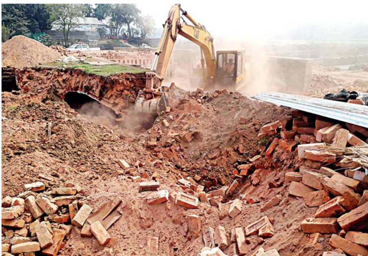
A bulldozer destroying bricks at an illegal brick kiln in Gazipur city's Dhitpur area on Monday. Department of Environment conducted a mobile court drive there. Toxic fumes emitted from brick kilns are largely blamed for the poor air quality in and around the capital.

Weinstein, the producer of "Pulp Fiction" and "Sin City," is the first man accused of abuse in the #MeToo movement to face a criminal trial.