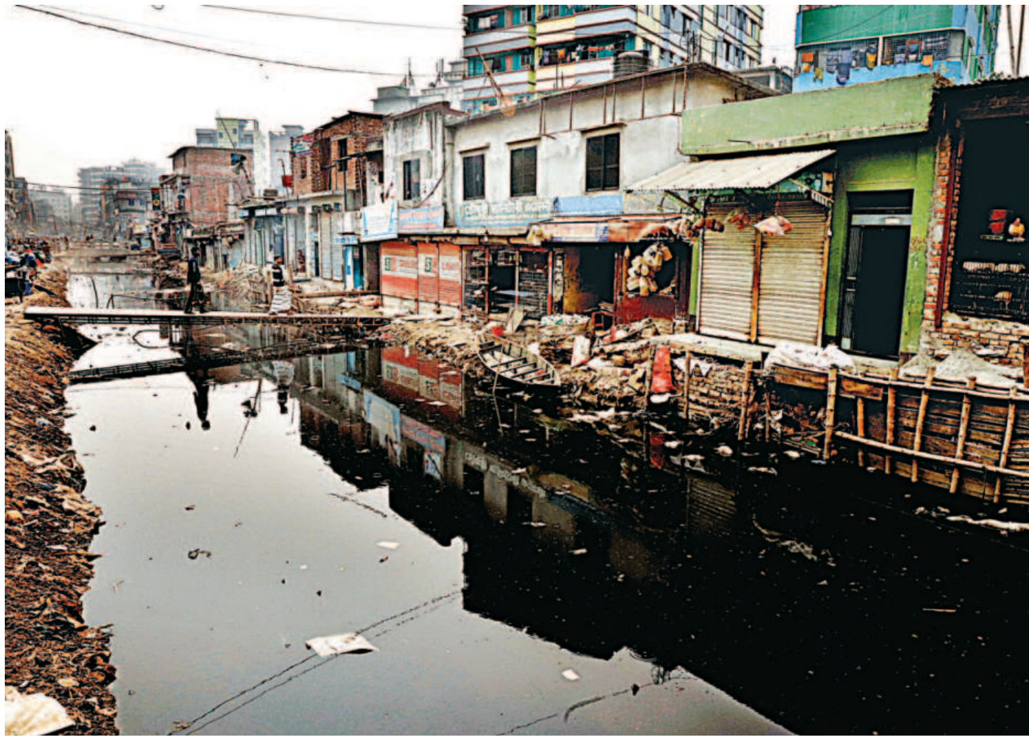
Dirt, debris, and waste turn the Kutubkhali canal water dark in the capital's Shonir Akhra area and give off an overpowering stench. The water of this canal flows into the Shitalakkhya river. This picture was taken yesterday.