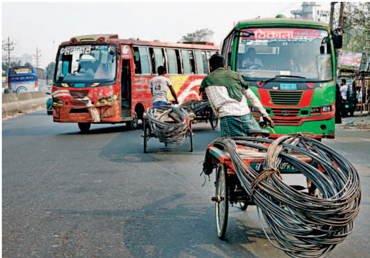
Rickshaw vans carrying steel rods travel against the traffic near Rayerbagh bus stand on the Dhaka-Chattogram highway. Scenes like this are very common there and the traffic policemen stationed there, not in frame, rarely take action to stop the blatant breach of traffic law.