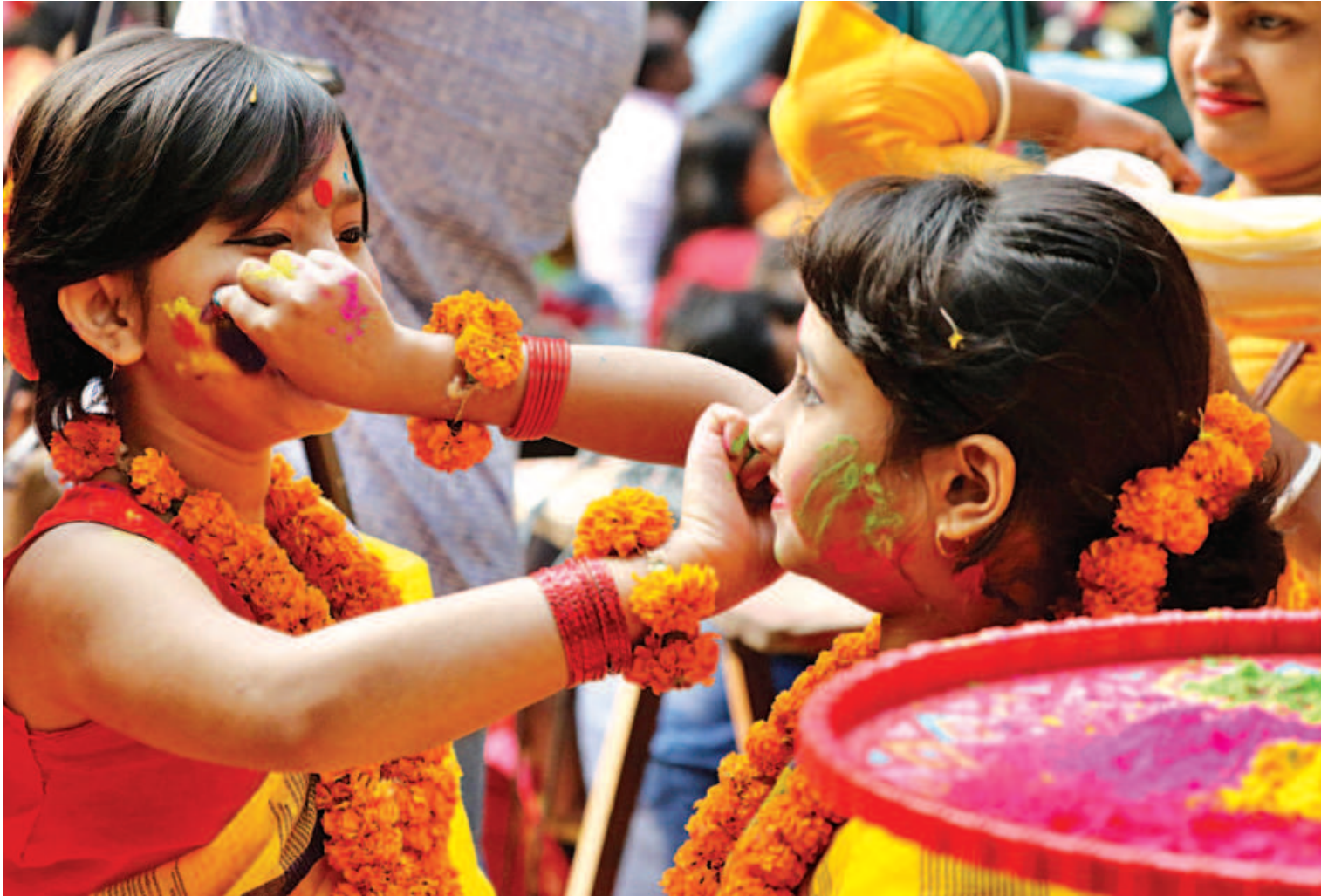
Clad in yellow saris, two children applying coloured powder on each other's face during Basanta Utsab at the Bakultala on the premises of Dhaka University's fine arts faculty yesterday. Jatiya Boshonto Utsab Udjapan Parishad organised the yearly event on the first day of the Bengali month of Falgun to welcome the spring.