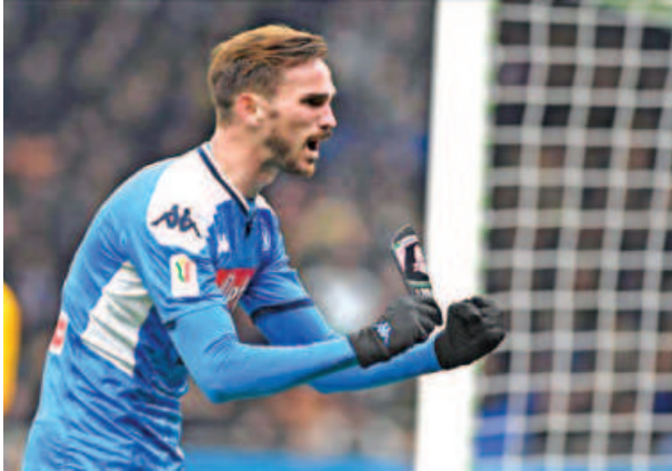
Fabian Ruiz celebrates his decisive goal Napoli against Inter Milan during a 1-0 win in their Coppa Italia semifinal first leg on Wednesday.