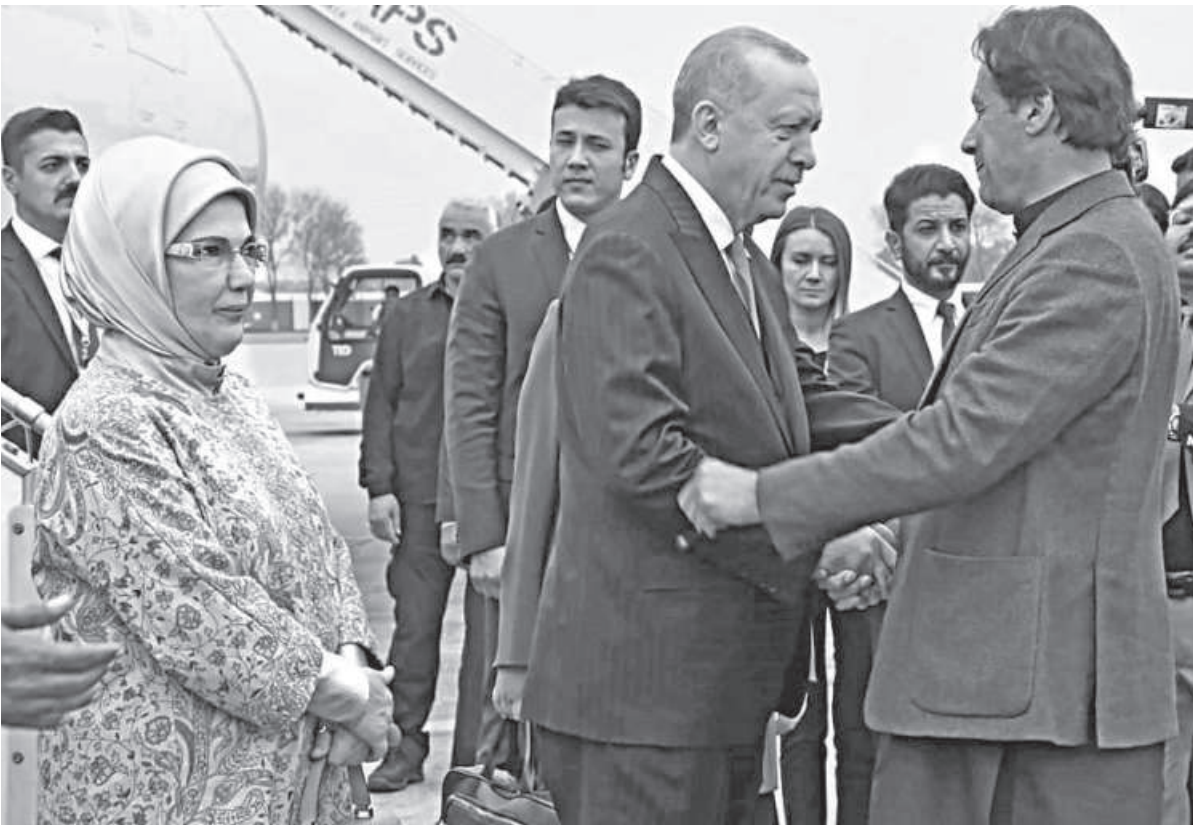
Turkish President Recep Tayyip Erdogan (C) shakes hands with Pakistan’s Prime Minister Imran Khan upon his arrival at the Nur Khan airport in Rawalpindi, yesterday.

The VFA is important to the overall US-Philippines alliance and sets out rules for U.S. soldiers operating in the Philippines, a former US territory. Washington has called the relationship “ironclad,” despite Duterte’s complaints that include allegations of U.S. hypocrisy and ill treatment.