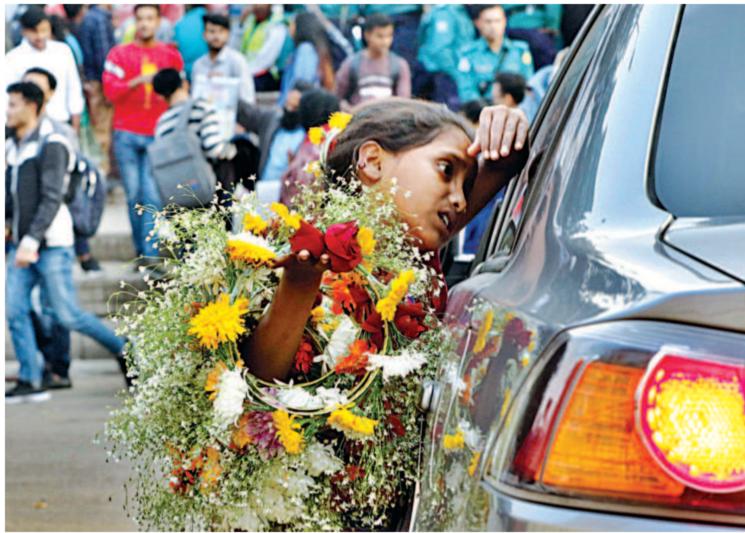
Ahead of Pehela Falgun and Valentine's Day celebrations, a girl tries to sell some flowers to people in a car in Dhaka University's TSC area yesterday.

TREAT IT AS NATIONAL CRISIS - PAGE 3 SEE PAGE 11 COL 2