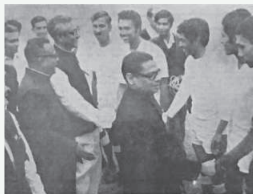
Bangabandhu and President Justice Abu Sayeed Choudhury at Dhaka Stadium to meet the players in a charity match on February 13, 1972.