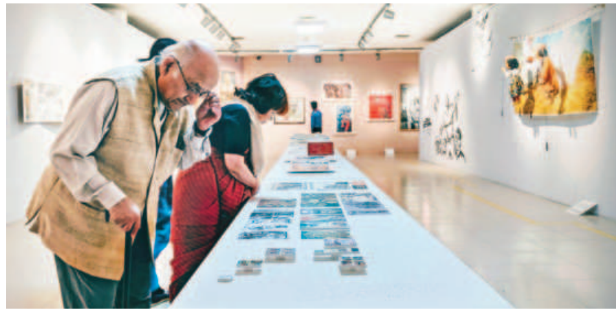
Economist and freedom fighter Rahman Sobhan (L) at the exhibition.

Dhaka Art Summit 2020 Seismic Movements সঞ্চারণ 7-15 February 2020 Title: Dhaka Art Summit 2020 Venue: Bangladesh Shilpakala Academy Date: February 7 – 15 Time: 10 am – 8 pm