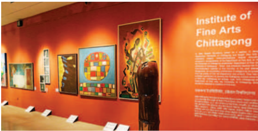
Artworks on exhibit at the event.