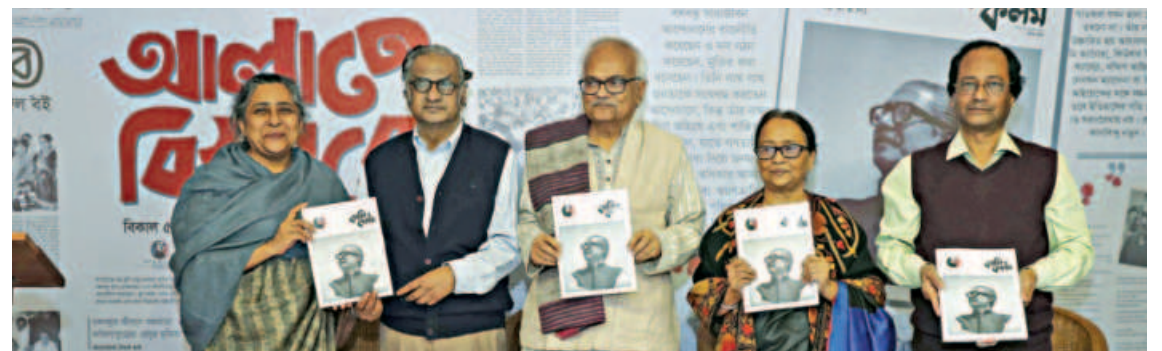
The esteemed guests at the launching programme of Kali O Kolom's special edition.