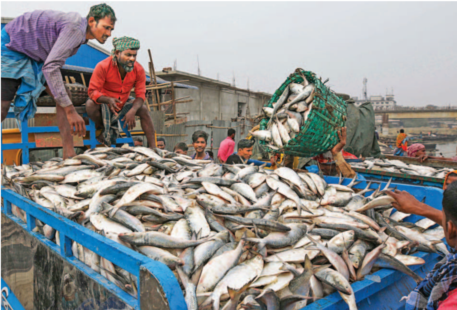
There's been an unprecedented boom in the country's hilsa market this winter, with enough fish being caught to fill up one truck after another. This photo was taken at Notun Bazar in Chattogram's Chaktai recently.