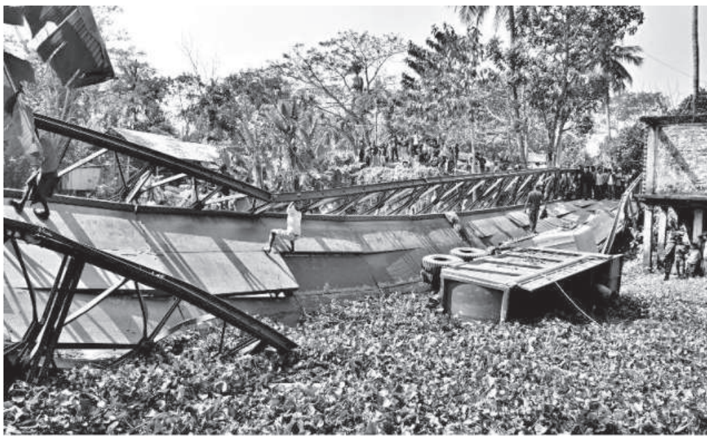
This steel bridge near Madhabpasha Union Parishad under Babuganj upazila of Barishal collapsed after a heavyweight stone-laden truck attempted to cross it yesterday morning, cutting off road communication between Barishal and two upazilas of Pirojpur. According to officials of Roads and Highways, the bridge had a load capacity of 5 tonnes but the truck was carrying over 20 tonnes of weight.

ACC filed a case against the five on July 25 last year. On November 27, ACC's Abu Bakar Siddique submitted the charge sheet.