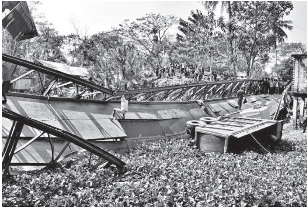
This steel bridge near Madhabpasha Union Parishad under Babuganj upazila in Barishal collapsed after a heavyweight stone-laden truck attempted to cross it yesterday morning.