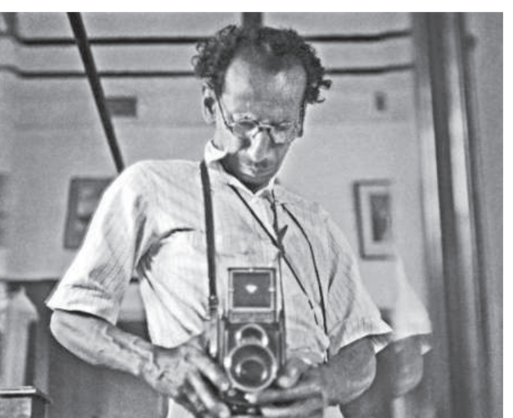
The enlarged self portrait of Daddy with his box camera.

When The Mind Says Yes is open to all till March 25, every day from 10 am to 8 pm.