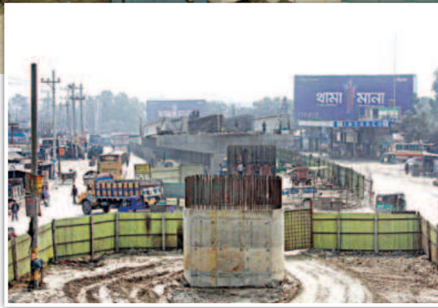
An under-construction flyover on the Dhaka-Tangail highway in Tangail Sadar's Rabna Bypass area. This is one of the nine flyovers being built under a project to upgrade a 70-kilometre stretch of the highway to a four-lane one. The project authorities may not be able to complete construction of four of the flyovers within an extended deadline ending in June. The photos were taken on Wednesday.