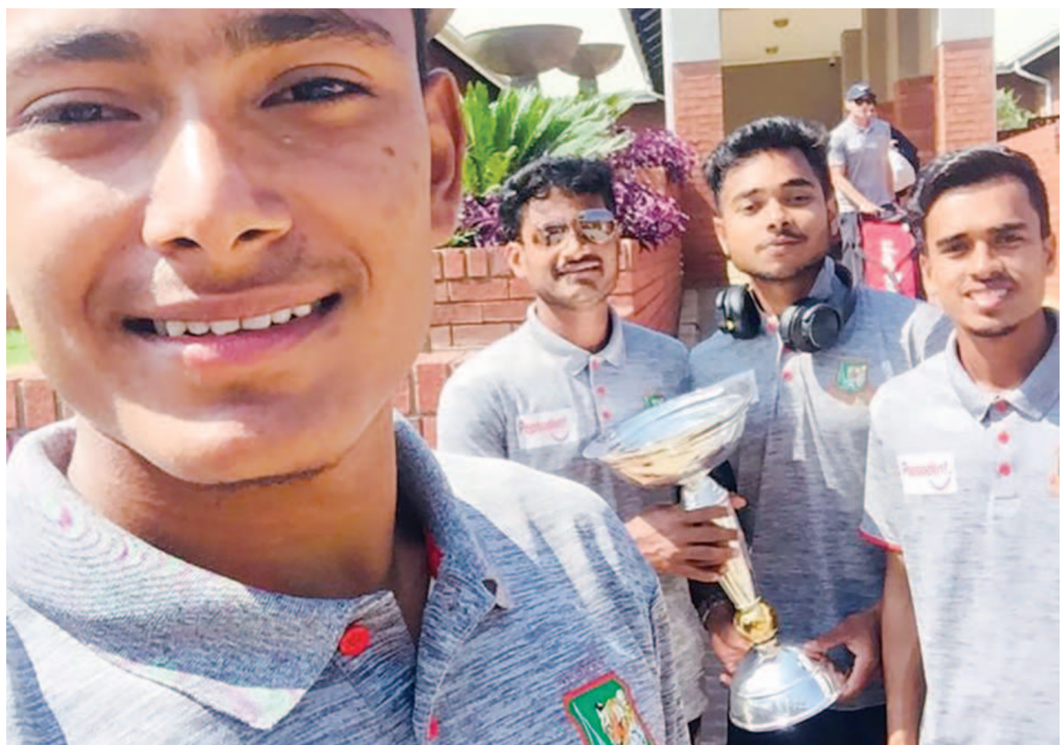
A day after their ICC Under-19 World Cup triumph, Bangladesh Under-19 cricketers take a selfie with the coveted trophy in Potchefstroom of South Africa yesterday. The young Tigers will return home this afternoon.