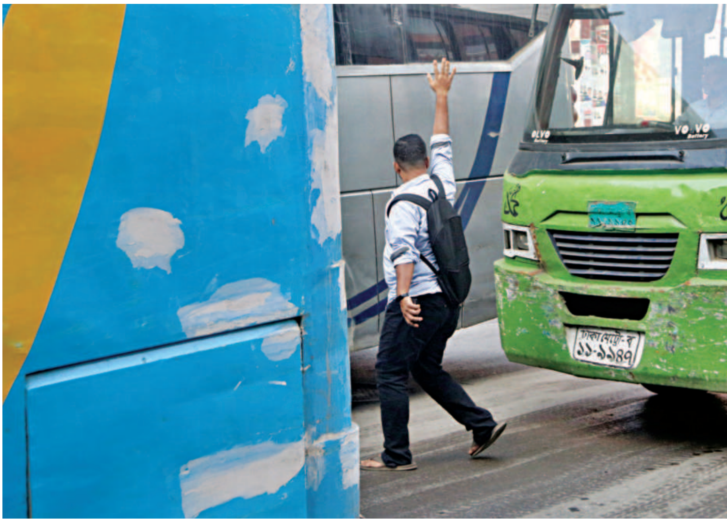
A man signals a bus to stop as he jaywalks across a road in the capital's Farmgate yesterday. At the time the photo was taken, the man was surrounded by three buses and his actions put not only his but also others' lives at risk.