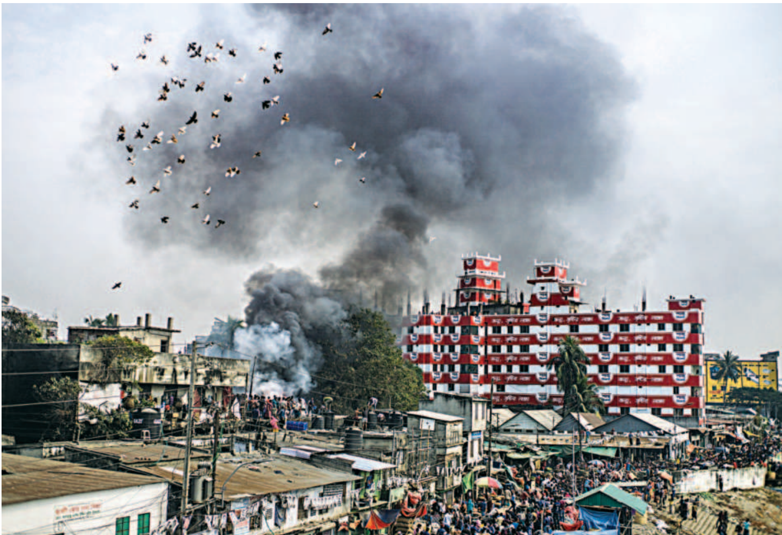
Thick smoke billowing from a building after a storage of plastic barrels caught fire yesterday afternoon in the capital's Shyambazar. Fires in plastic factories and storage facilities in Old Dhaka have caused major tragedies in recent years.