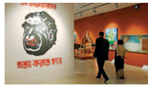
Visitors at the special exhibition, 'Roots'.