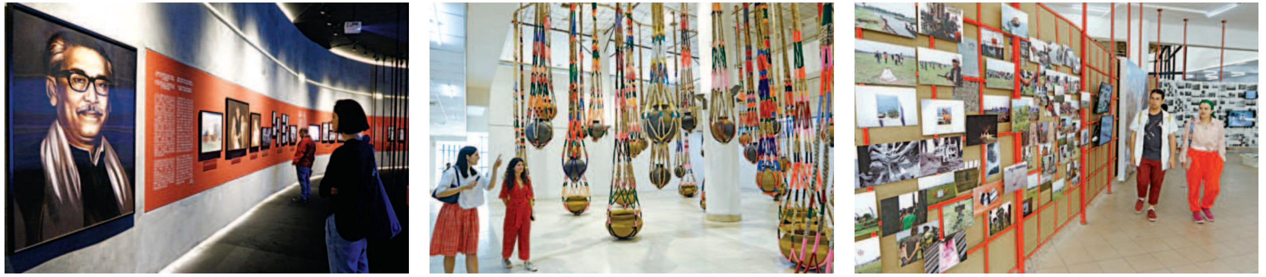
(L) Visitors at 'Lighting the Fire of Freedom: Bangabandhu Sheikh Mujibur Rahman'. (M) An installation on display at the summit. (R) The summit welcomes visitors from all over the world.