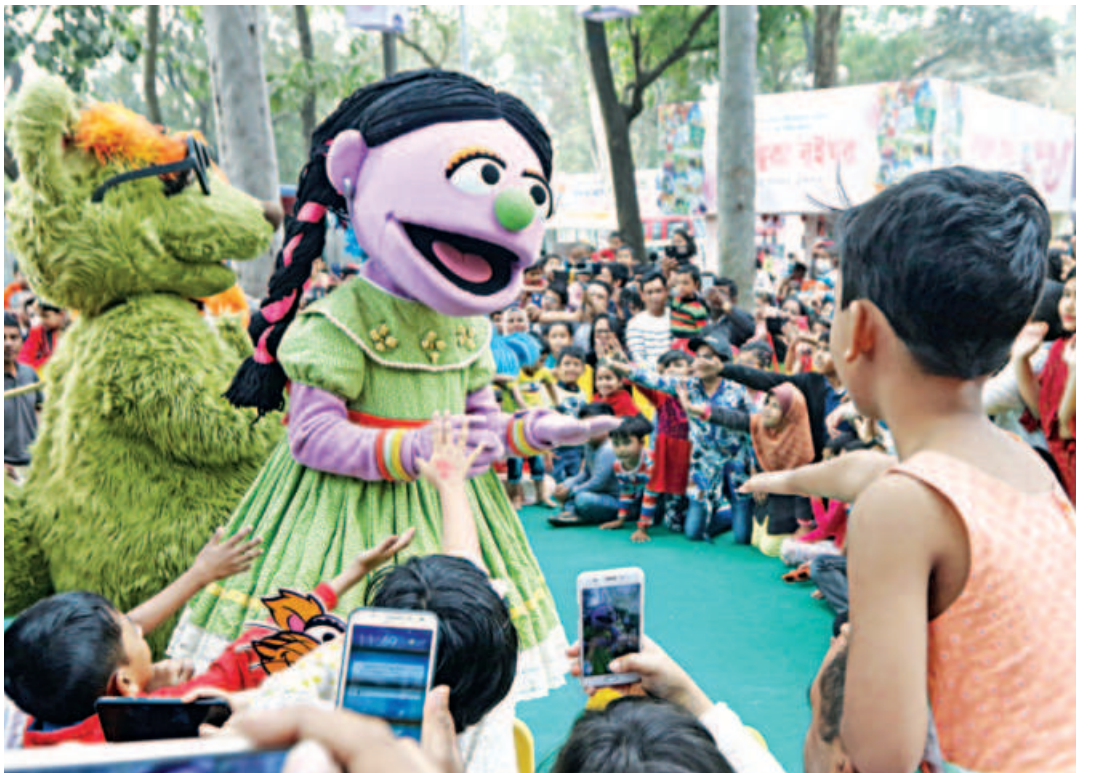
Children were filled with joy at Amar Ekushey Grantha Mela yesterday, as their favourite characters from Sisimpur performed in front of their very eyes. The show's Halum, Ikri and Tuktuki, among others, put on a wonderful show at the children's corner of Suhrawardy Udyan. Children were also seen huddled in front of stalls catering to them, some trying to reach the books on display, while others climbing on to their parents' lap to get a better look.