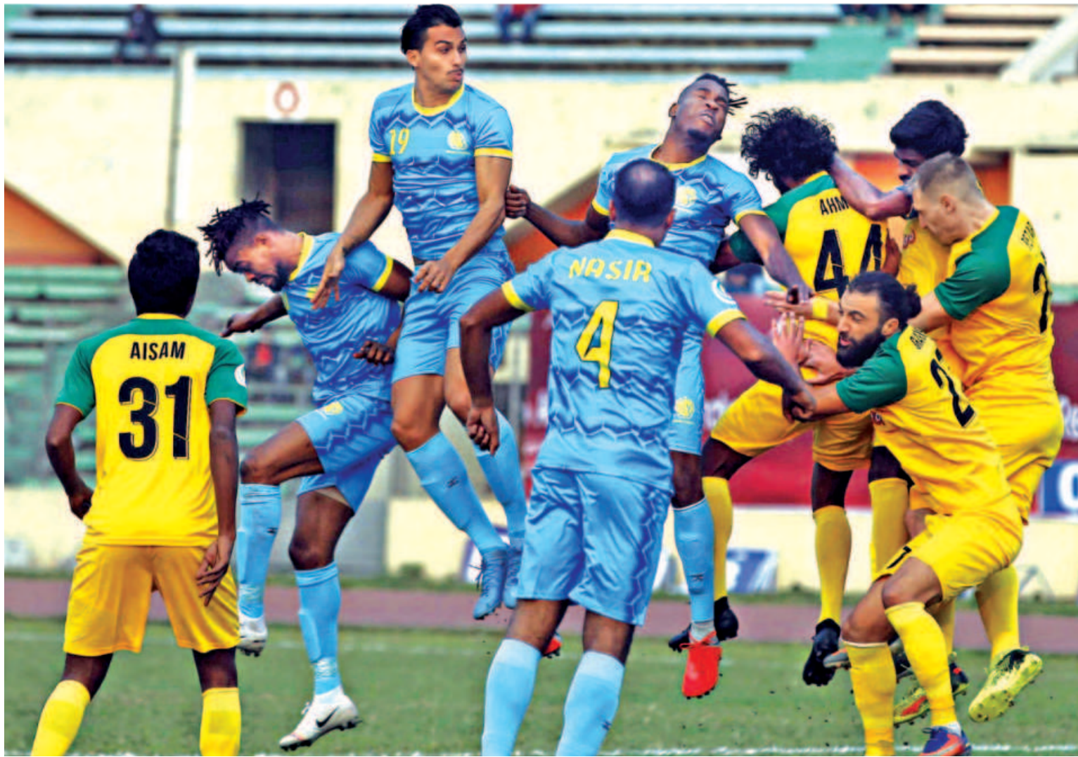
Abahani and Maziya players tussle for aerial possession during their AFC Cup preliminary round first leg match at the Bangabandhu National Stadium yesterday. The match ended in a 2-2 draw.