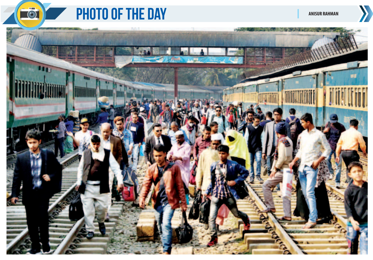
A MASS DISPLAY OF RECKLESSNESS... Despite spacious platforms being available on both sides of the rail lines and an over-bridge to cross over, people board off trains in the capital's Biman Bandar station on the tracks every day, with zero regards for safety. Men or women, old or young, sharply-dressed or shabby -- when it comes to being irresponsible, it seems we are all more alike than it appears.