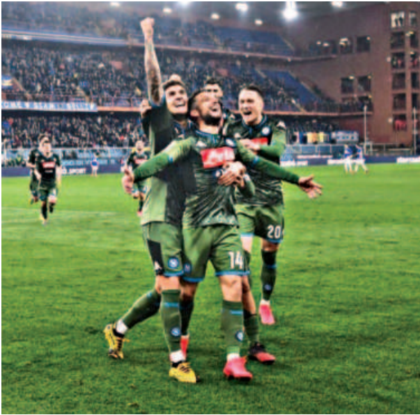
Dries Mertens is mobbed by his teammates following his late goal, which saw the Partenopei notch a 4-2 win over Sampdoria in their Serie A fixture in Genoa on Monday.

Atletico Madrid's injury crisis has deepened with Kieran Trippier set to miss up to a month after undergoing groin surgery on Tuesday. The English defender had missed three league games with a groin strain, which did not heal while he was resting. "Our right-back had been feeling pain and initially followed a conservative treatment," said Atletico in a statement. Reports in Spain say the defender will be out for around a month. Atletico are already without Alvaro Morata, Joao Felix, Diego Costa, Koke, Jose Gimenez and Santiago Arias, while Felipe is suspended for Saturday's clash with Granada.