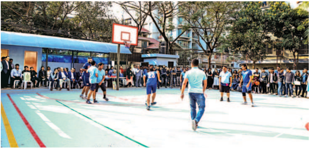
Independent University, Bangladesh students and faculty play a basketball match during the inauguration of the university's sports complex at the university campus on Sunday.