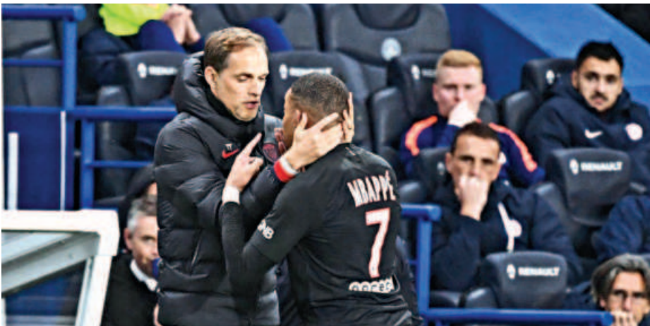
Tuchel had a word with Mbappe after substituting the striker during their league fixture against Montpellier on Saturday.

Paris Saint-Germain coach Thomas Tuchel on Monday attempted to play down a touchline spat with Kylian Mbappe which overshadowed the French champions' big weekend win over Montpellier. "There is nothing personal between him and me. These things happen," said Tuchel after Mbappe reacted angrily to being substituted midway through the second half of PSG's 5-0 victory at the Parc des Princes, with Mauro Icardi taking his place. "It was between a player who does not want to come off, and a coach who had his reasons for doing something, and who wanted to give a game to players who deserved it." After Saturday's match, Tuchel admitted that the reaction of Mbappe "doesn't look good" and pointed out that: "This is football, not tennis, and you have to respect everyone." The 21-year-old World Cup winner, who had scored his 14th league goal of the season in the victory, exchanged words with