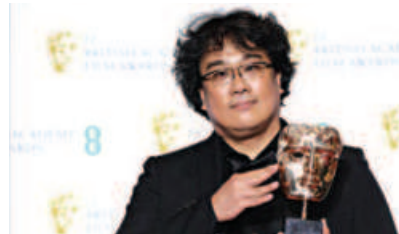
Bong Joon Ho with his award for Film Not in the English Language for 'Parasite'.

1917, Sam Mendes's visually extravagant World War I drama that takes viewers into the chaos of the trenches was the big winner at the British Academy Film Awards recently, taking seven awards, including best film. Mendes was also named best director at the event. Better known as the BAFTAs, the programme is Britain's equivalent of the Oscars. Here is a list of winners in the other key categories: