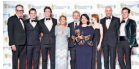
The team of '1917' with their award for Best Film.