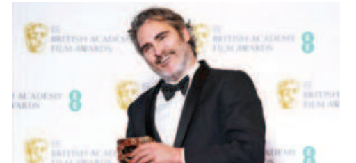
Joaquin Phoenix with his Best Actor award for 'Joker'.