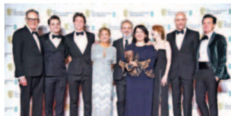
The team of '1917' with their award for Best Film.