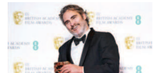
Joaquin Phoenix with his Best Actor award for 'Joker'.