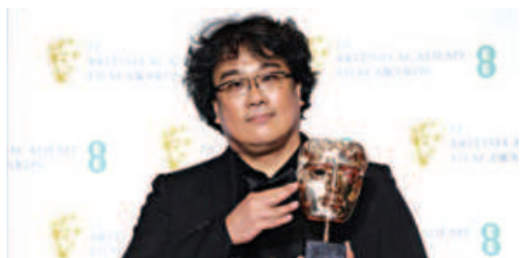
Bong Joon Ho with his award for Film Not in the English Language for 'Parasite'.

1917, Sam Mendes's visually extravagant World War I drama that takes viewers into the chaos of the trenches was the big winner at the British Academy Film Awards recently, taking seven awards, including best film. Mendes was also named best director at the event. Better known as the BAFTAs, the programme is Britain's equivalent of the Oscars. Here is a list of winners in the other key categories: