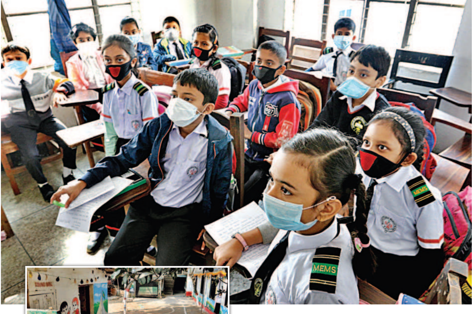
Children attend class, wearing protective masks at Mascot Innovative School and College in the capital's Ashkona area. Inset, a notice hung on the school gate requests all to put on masks for protection against coronavirus. More than 300 Bangladeshis, brought back from coronavirus-hit Chinese city of Wuhan, are being kept in quarantine at nearby Ashkona Hajj Camp.