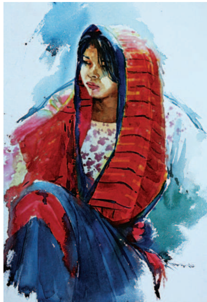
Artworks on exhibit at the event.