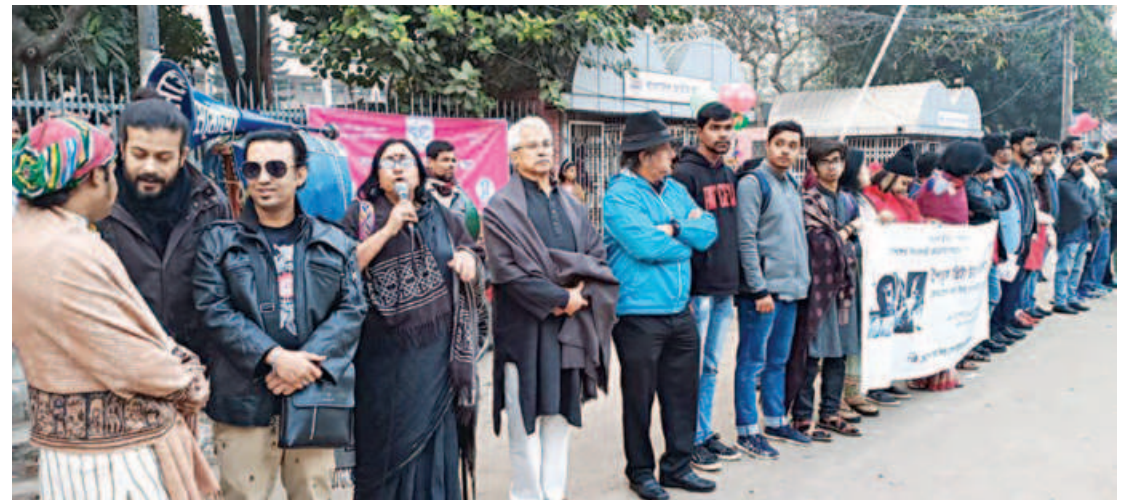
The human chain at Shahbagh, Dhaka.

A movement in support of a global campaign to restore the ancestral houses of legendary film directors Satyajit Ray, Ritwik Ghatak and Mrinal Sen in Bangladesh, has started.