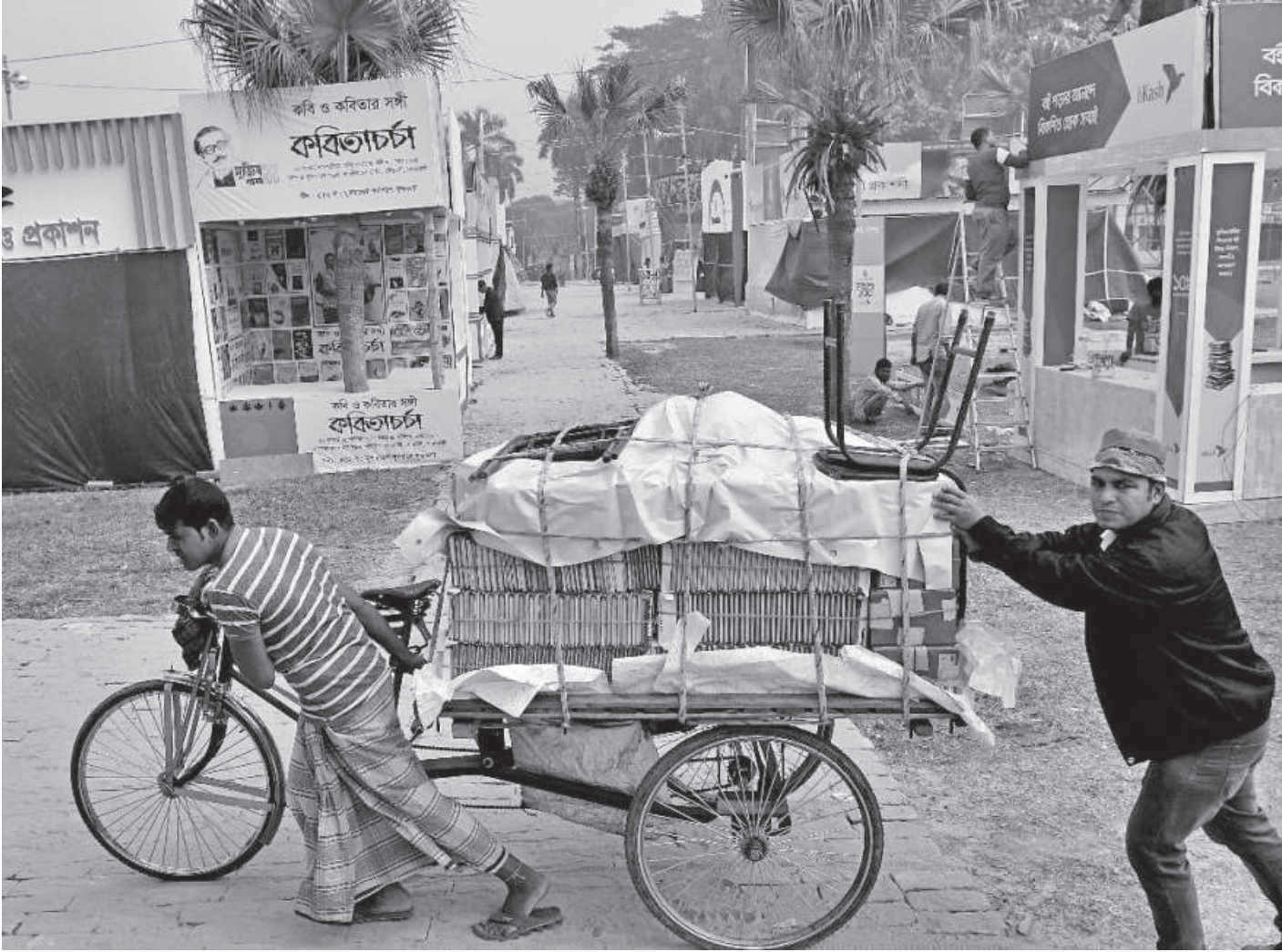
HOT OFF THE PRESS... Books being delivered to a stall at Suhrawardy Udyan yesterday, ahead of month-long Amar Ekushey Grantha Mela. The country's largest book fair begins tomorrow.