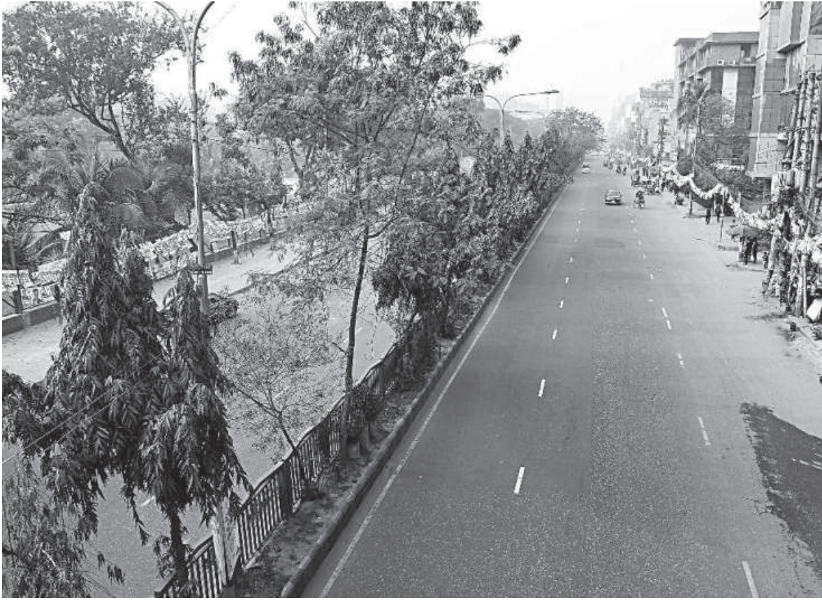
The streets of Dhaka were empty throughout most of yesterday. On top of being the day before the city polls, it was also a Friday, which meant people had little incentive to commute. The photo was taken from Mirpur Road.