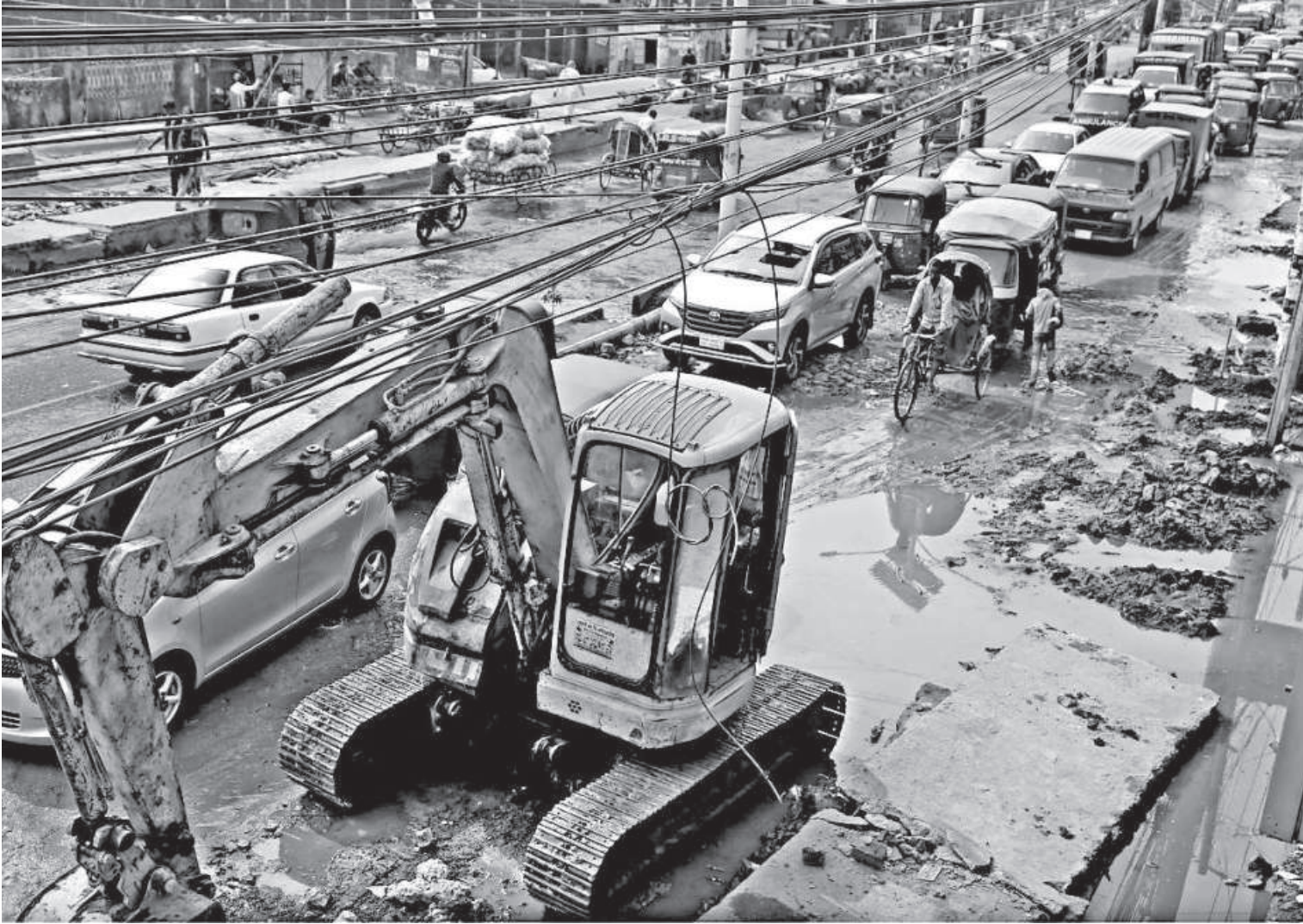
Citizens suffer from ongoing road expansion and drainage repair work in Sylhet's Madina Market area, especially due to the lack of alternative routes for vehicles to travel through. To add to the woes, water used in the construction work and trash extracted from the drains are being dumped right on the street.