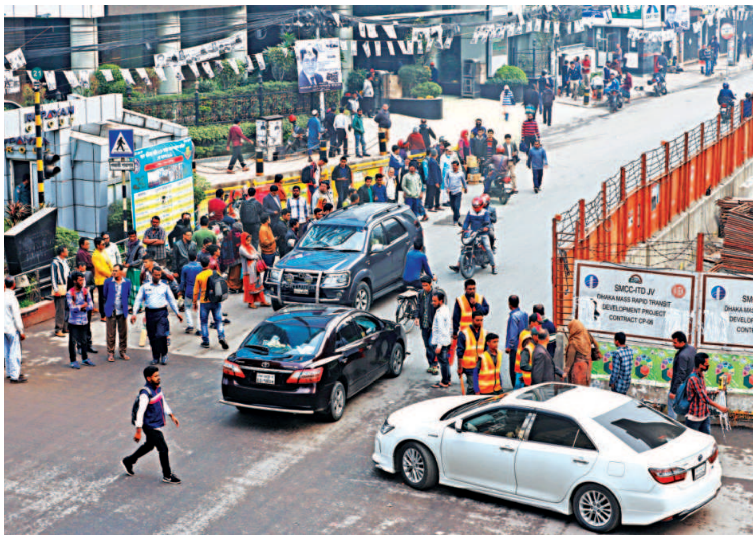
With blatant disregard for traffic laws, an SUV, with an equally culpable motorcyclist in tow, go against traffic in full view of the traffic police in the capital's Banglamotor yesterday.