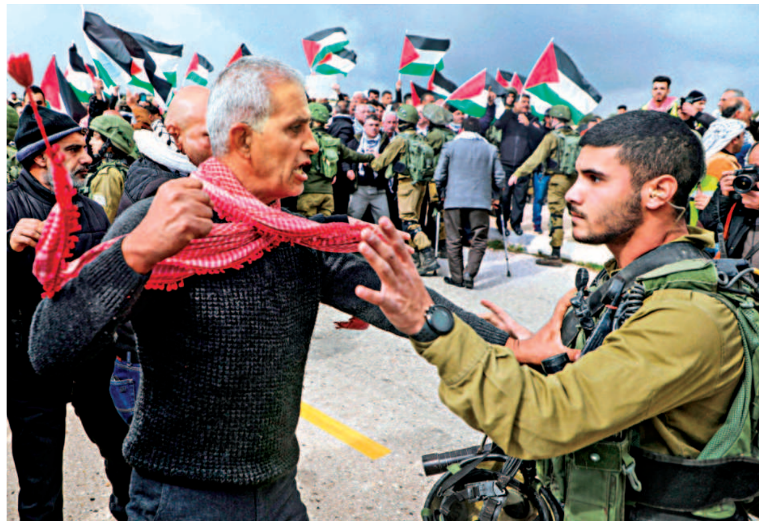
A Palestinian demonstrator confronts an Israeli soldier near the West Bank village of Tubas yesterday during a demonstration against the US President Donald Trump's peace proposals. Trump's long delayed Middle East peace plan won support in Israel but was bitterly rejected by Palestinians facing possible Israeli annexation of key parts of the West Bank.