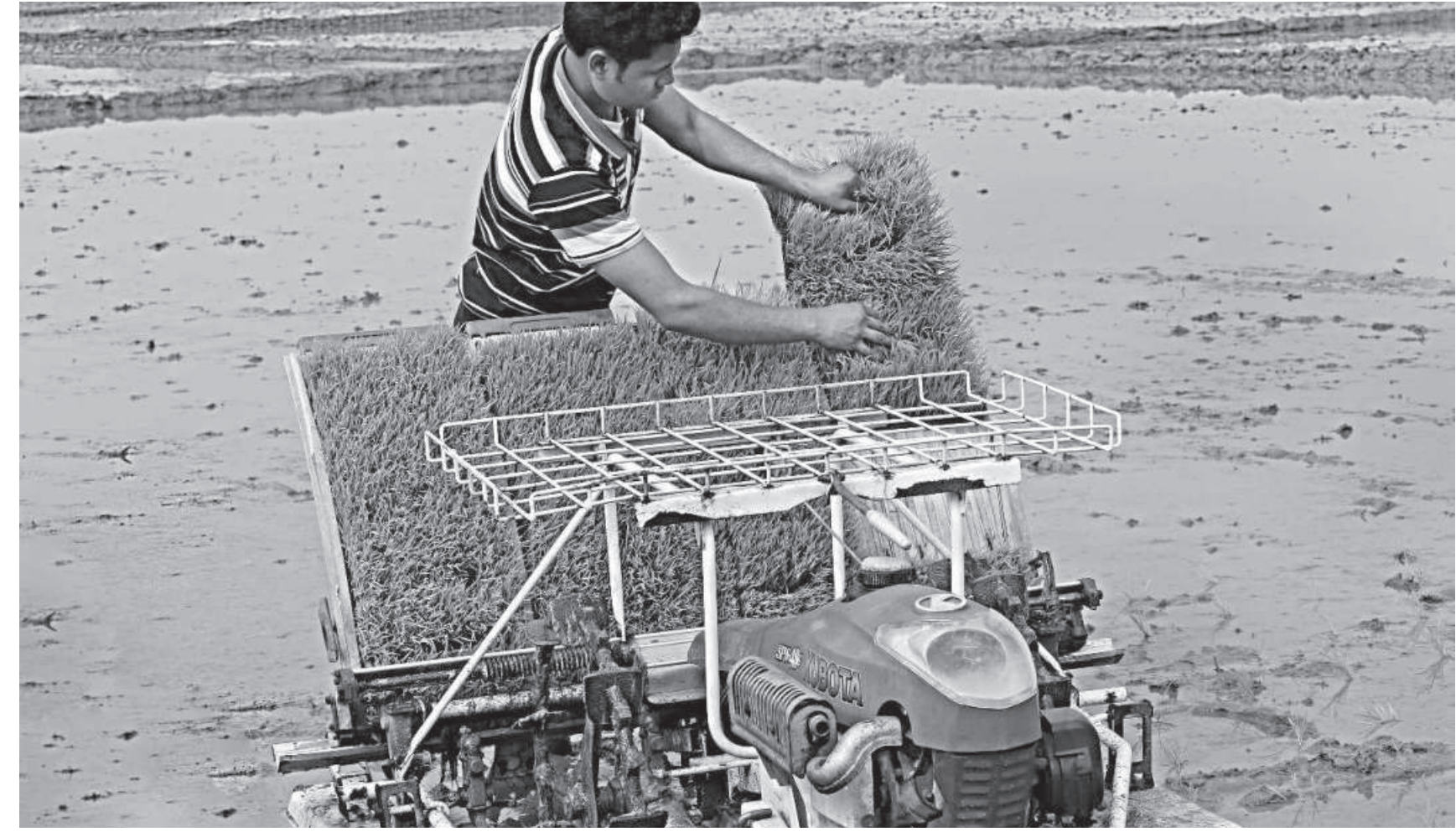
A worker loads a mechanised paddy transplanting machine with seedlings in Chawkerhaat village of Biral upazila. The photo was taken on Tuesday.

with support from APL, used modern machinery to prepare seedbed, collect seedlings and prepare the main paddy field for sowing, said farmer Motiur.