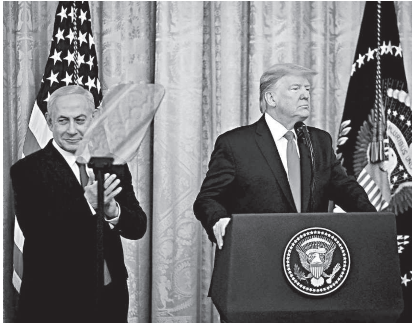
Israel's Prime Minister Benjamin Netanyahu and President Donald Trump take part in an announcement of Trump's Middle East peace plan at the White House in Washington, D.C. on Jan. 28, 2020.

What the US has actually done is wrap the long term Israeli plan inside a glossy looking peace plan, which engenders no prospect of peace but accentuates the possibility of further violence in the region. Do the Palestinians have any other option than to reject it out of hand, which they had done well before it was formally announced by Trump on January 28? The purpose, regrettably, is not peace but to push the Palestinians up against the wall, compel them to reject it and then paint