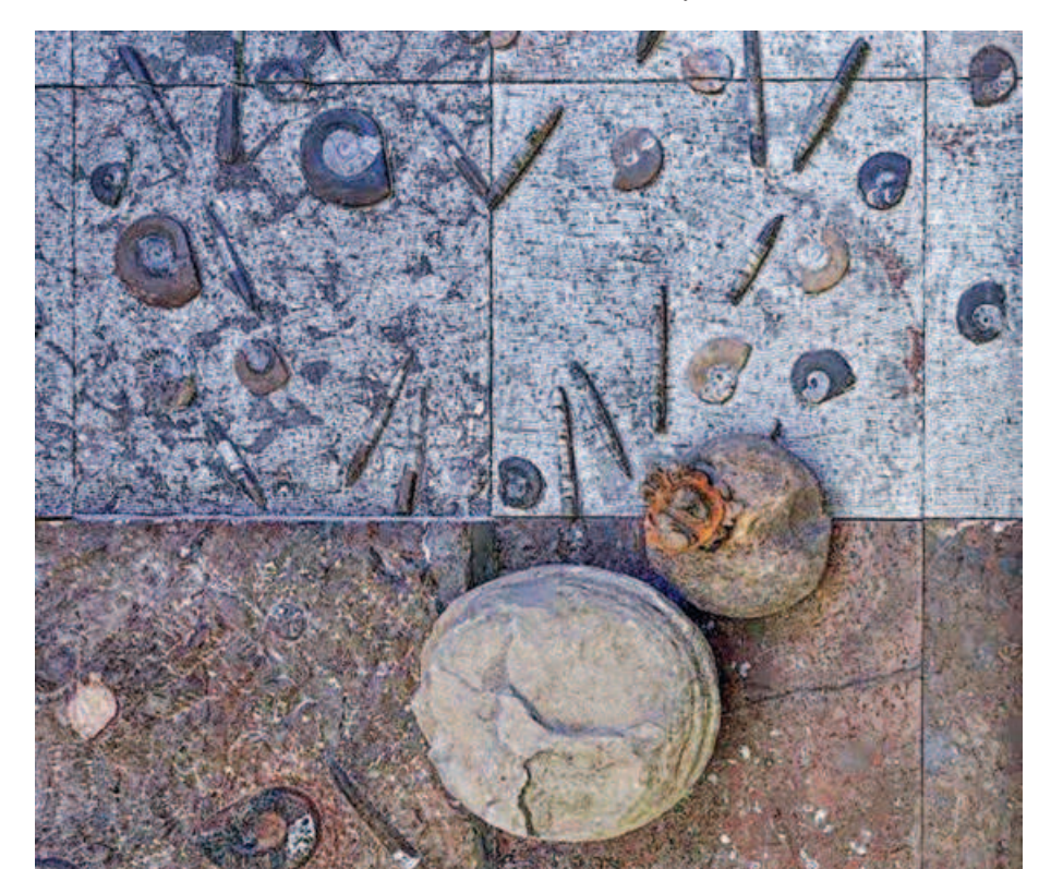
The Theater of Disappearance (detail), 2017. Floor tiles and blocks of brown marble with incrustations of ammonites and orthocer fossils. This work will comprise part of a permanent pavilion as part of the Samdani Art Foundation collection at Srihatta, the Samdani Art Centre and Sculpture Park.