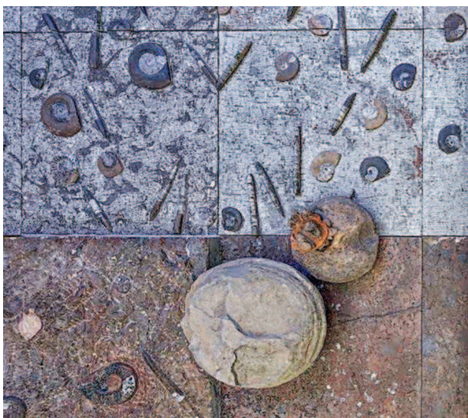
The Theater of Disappearance (detail), 2017. Floor tiles and blocks of brown marble with incrustations of ammonites and orthoceras fossils. This work will comprise part of a permanent pavilion as part of the Samdani Art Foundation collection at Srihatta, the Samdani Art Centre and Sculpture Park.