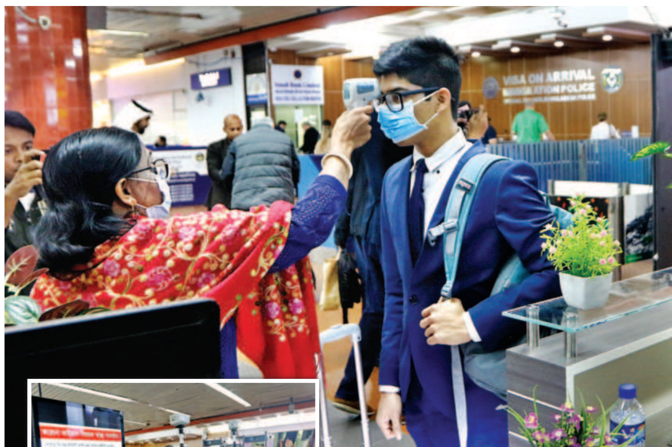
A passenger being screened with temperature checks after he landed at the capital’s Hazrat Shahjalal International Airport last night. Inset, a digital screen set up at the airport to make passengers aware about coronavirus. The airport authorities have taken the measures to prevent the virus from entering the country.