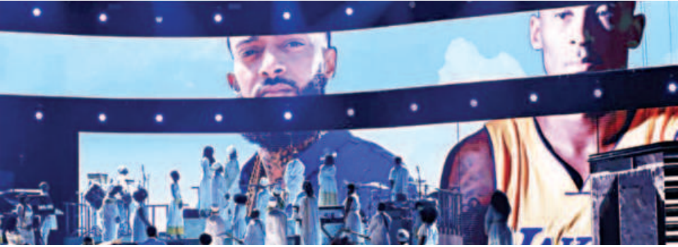
Pictures of Nipsey Hussle and Kobe Bryant are projected during a tribute.