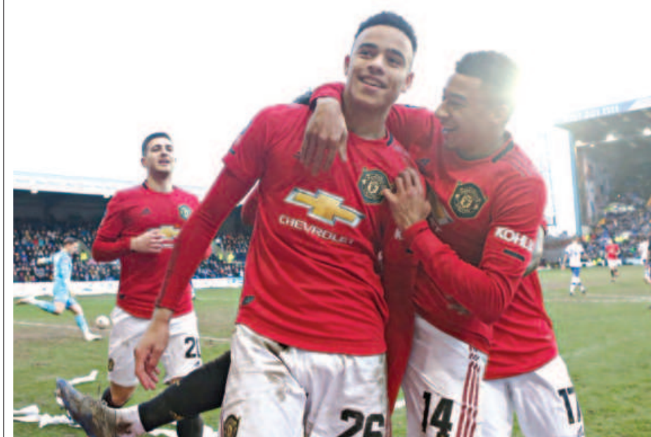
Mason Greenwood celebrates after putting the icing on Manchester United's cake with the final goal in their 6-0 FA Cup win over Tranmere Rovers on a shoddy Prenton Park pitch yesterday.

"Liverpool are just fantastic, phenomenal, overwhelming. So we have to accept it and learn from that," Guardiola said on the eve of the game.