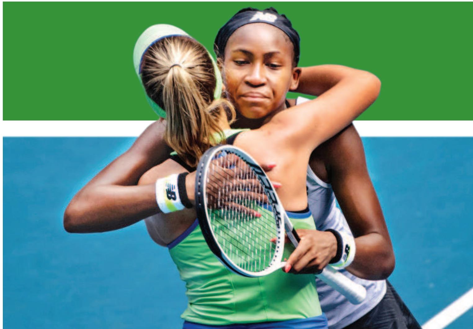
15-year-old sensation Coco Gauff battled past names like Venus Williams and title-holder Naomi Osaka, but her journey at the Australian Open ended in tears as she was outgunned by Sofia Kenin 6-7 (5-7), 6-3, 6-0 yesterday.