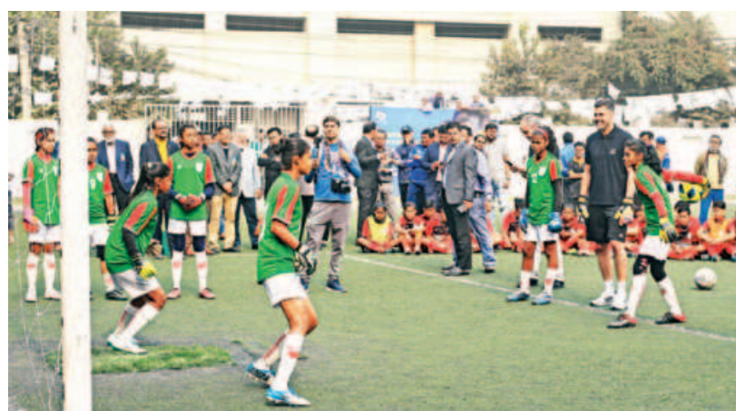
Former Brazil goalkeeper Julio Cesar had a vibrant time sharing his wisdom with the age-group-level goalkeepers under BFF's guidance during a session at the BFF Artificial Turf yesterday.

After his session with the footballers, he met up with the members of the Swadhin Bangla Football Team before heading to the Bangabandhu National Stadium to watch Bangladesh take on Burundi in the semifinal of the Bangabandhu Gold Cup.