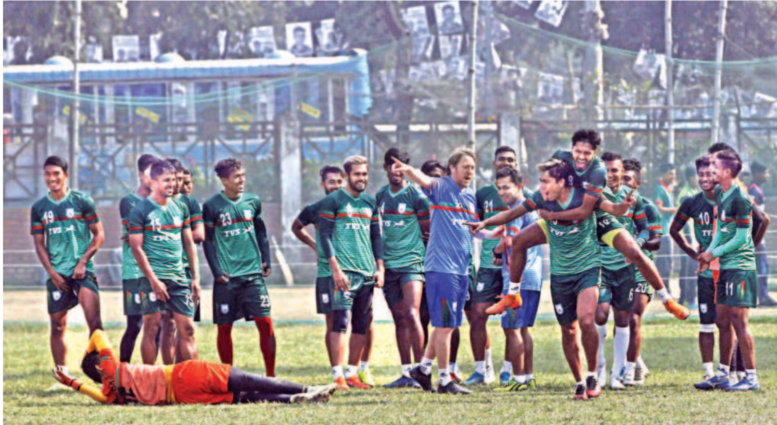
Bangladesh players were in jovial mood at the Sheikh Jamal DC ground yesterday ahead of today's Bangabandhu Gold Cup semifinal clash against Burundi. The match will kick off at 5:00pm at the Bangabandhu National Stadium.