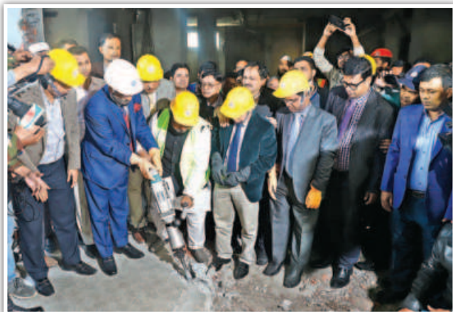
The much-talked-about demolition of the BGMEA building began yesterday. Inset, Housing and Public Works Minister SM Rezaul Karim inaugurating the ceremonial demolition.