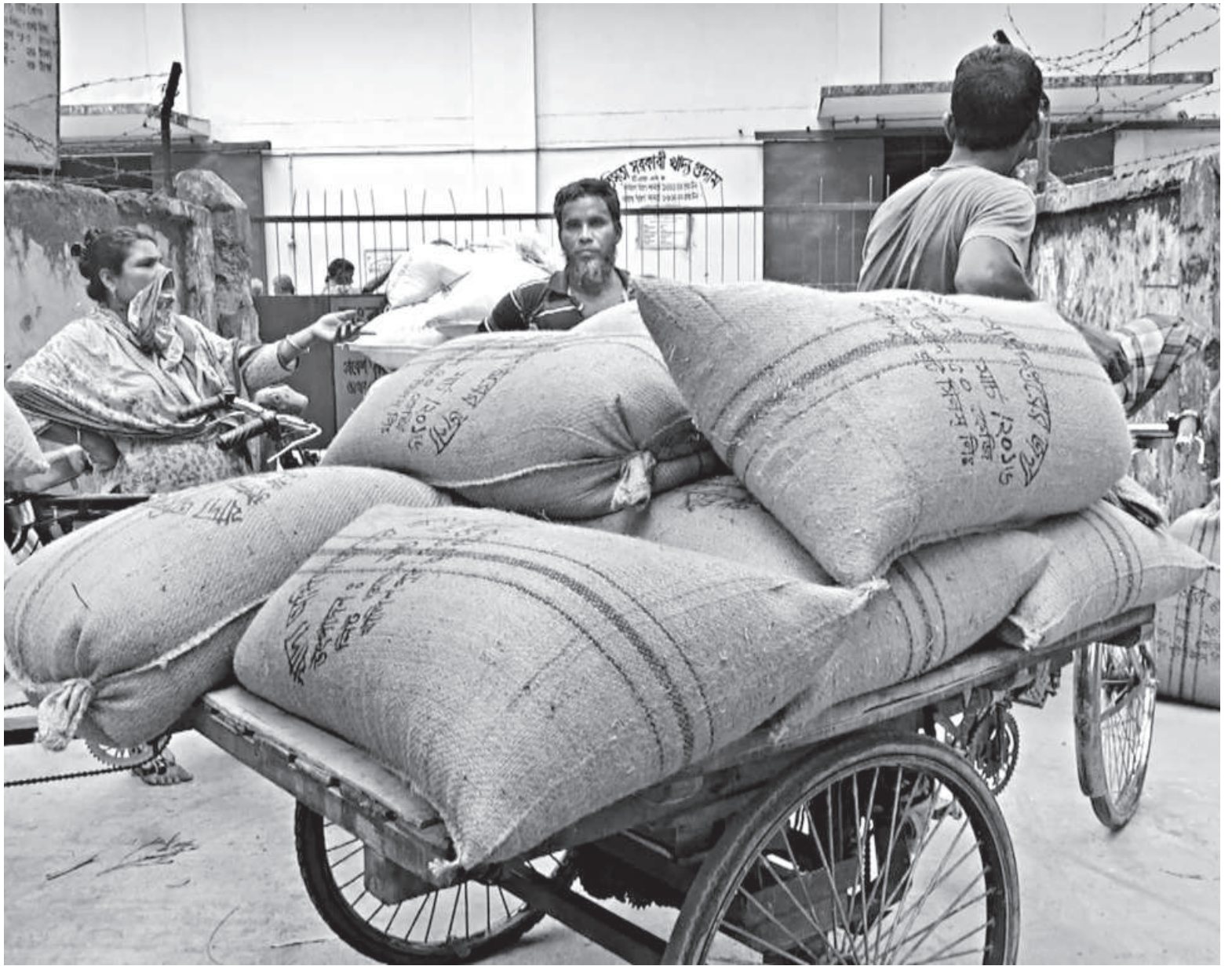
Farmers wait at a government warehouse in Lalmonirhat Sadar upazila to sell their paddy. The photo was taken on Sunday.