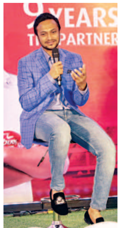
SHAKIB AL HASAN

Shakib replied in typical fashion when asked whether he was gearing up for a comeback, as shown in the video. "For that you have to wait until