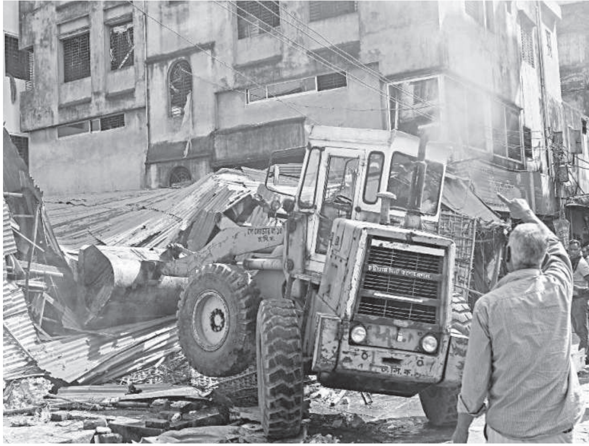
Chattoogram City Corporation, in a drive led by an executive magistrate, knocked down a number of makeshift shops in Hasmat Ullah Munsek Lane of the port city's Chawk Bazar area yesterday.