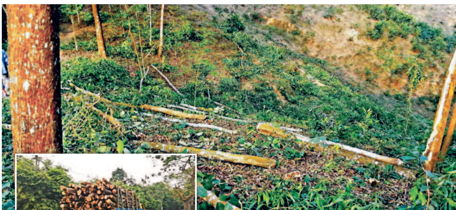
Logs lie scattered in the forest on a government-owned khas land in Paschim Singur area of Moulvibazar's Kulaura upazila on Tuesday, bearing testimony to mindless tree felling there while a truckload of logs (inset), allegedly collected from the forest, is being taken for sale.