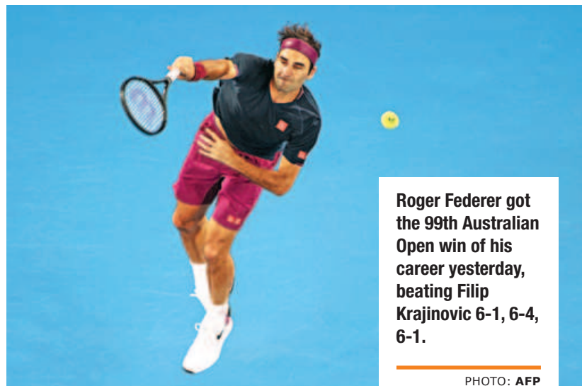
Roger Federer got the 99th Australian Open win of his career yesterday, beating Filip Krajinovic 6-1, 6-4, 6-1.

Among eight first-round matches held over from Tuesday, after rain wiped out half of Monday's schedule, Spain's Carla Suarez Navarro, also retiring this year, upset Belarusian 11th seed Aryna Sabalenka in straight sets.