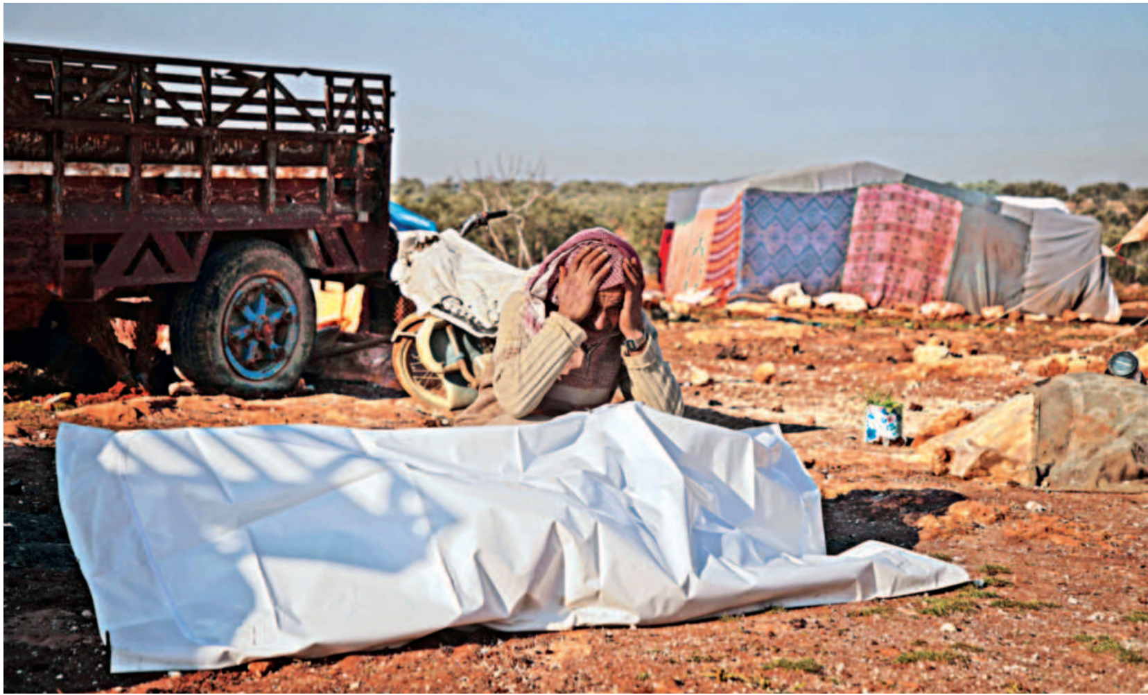
A man mourns over the body of his wife killed following an airstrike on the outskirts of the northern Syrian town of Atareb, yesterday. Russian air strikes killed at least 23 civilians Tuesday in northwestern Syria, as renewed violence tightened the noose around the country's last major rebel-held bastion and deepened an already dire humanitarian crisis.

Top judge Katerina Sakellariopoulou became Greece's first woman president yesterday when lawmakers elected her head of state in a rare display of unity. Sakellariopoulou, 64, has been president of the Council of State, Greece's top administrative court. She will succeed Prokopis Pavlopoulos, whose five-year term expires in March. She was backed by 261 MPs in the 300-member parliament.