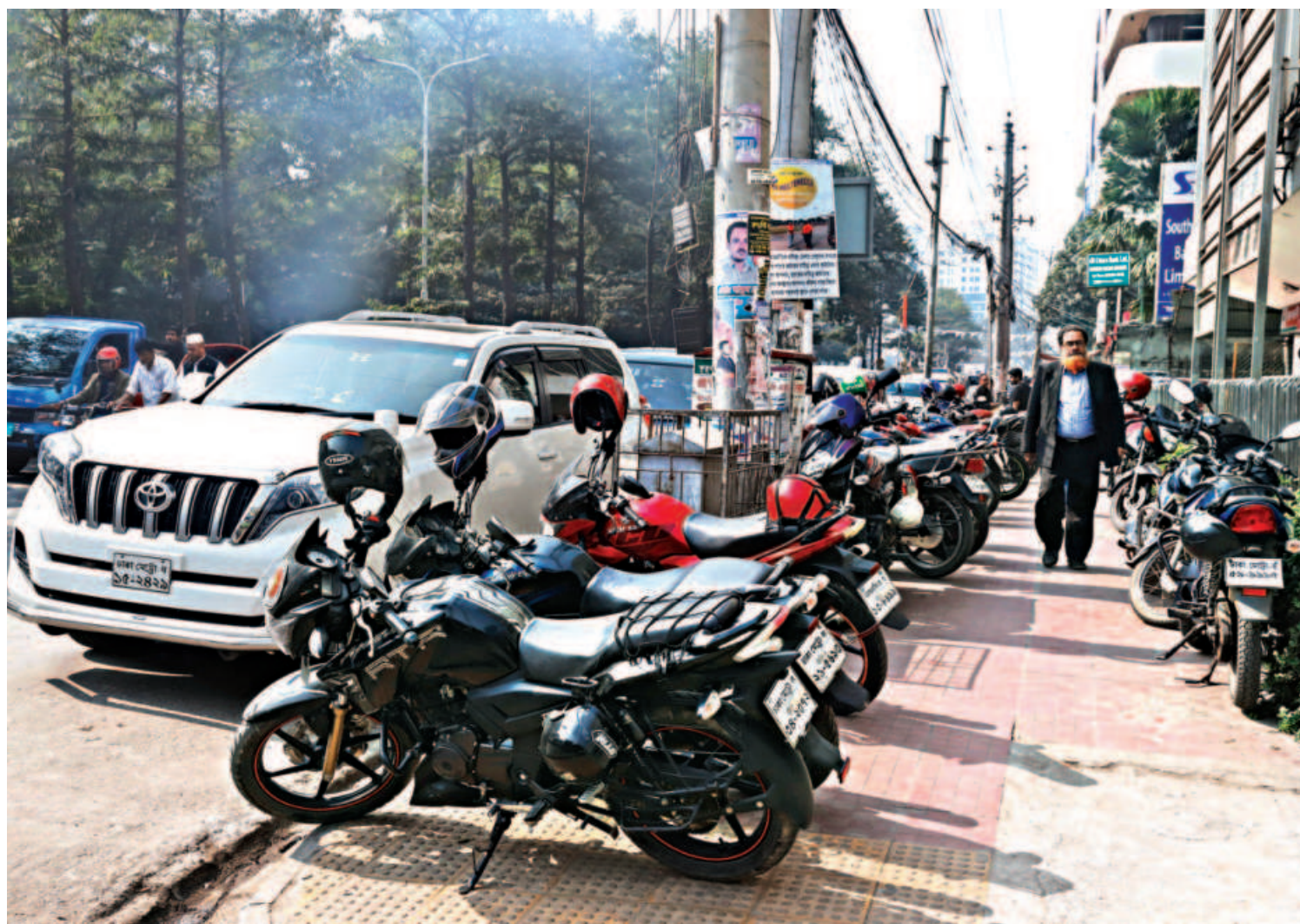
Despite a ban on parking vehicles on roads or footpaths, the TCB office footpath in front of Sonargaon hotel is lined with parked motorcycles, creating obstacles for pedestrians. The photo was taken yesterday.