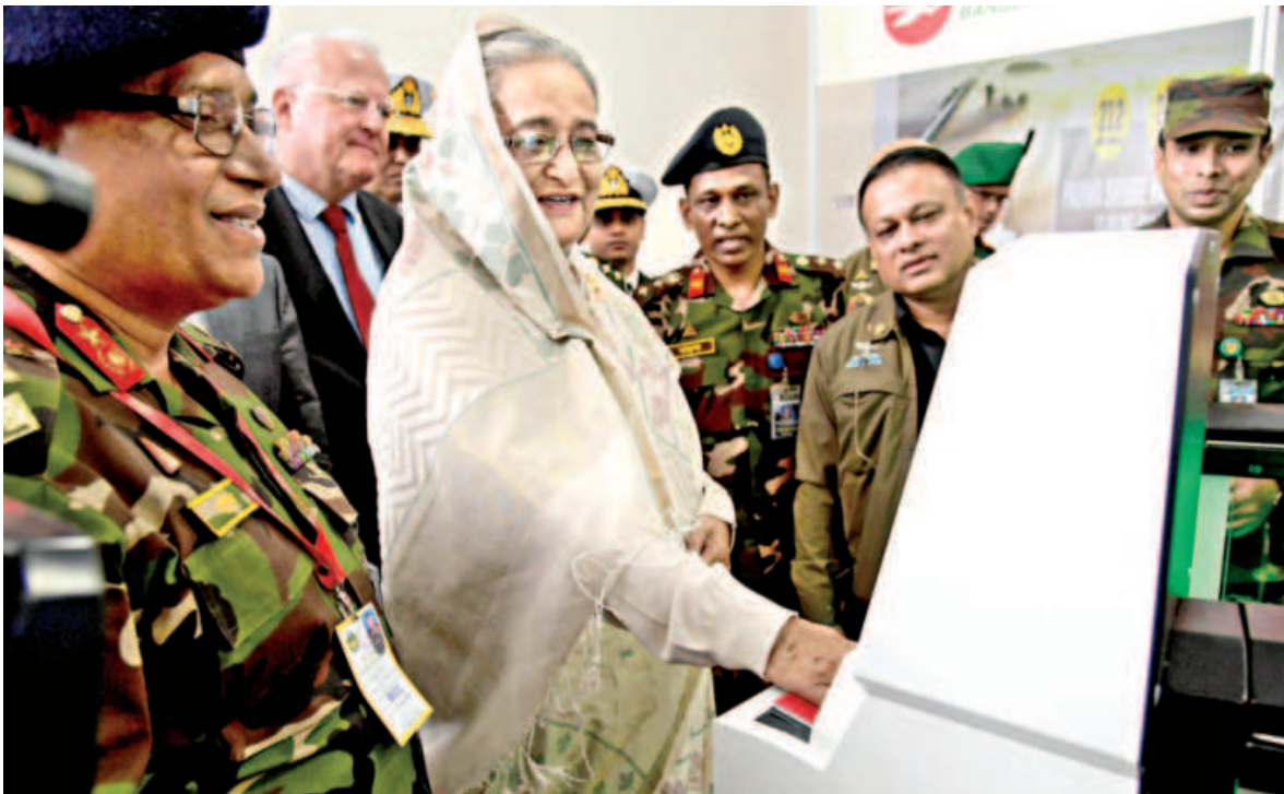
Prime Minister Sheikh Hasina scans her e-passport at a model immigration counter while inaugurating the distribution of electronic passports in a programme held at the Bangabandhu International Convention Centre yesterday. Story on page 16.