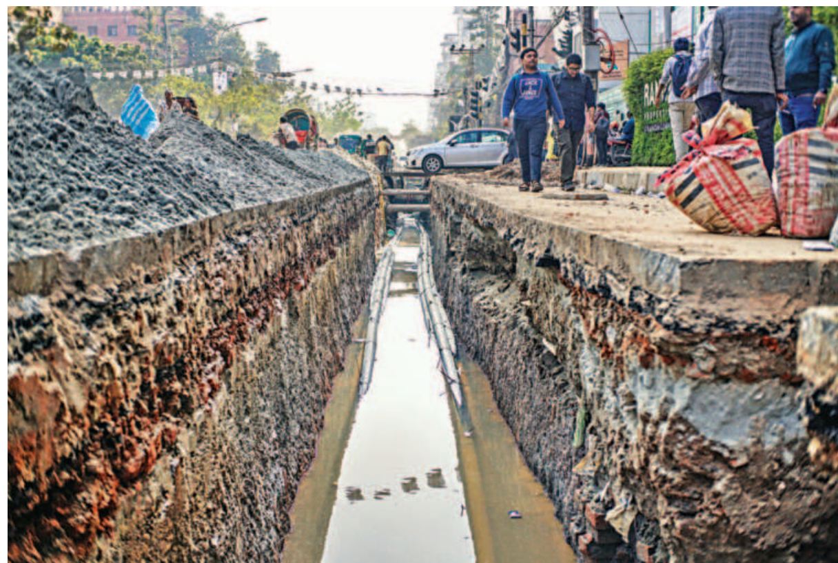
Pedestrians in Dhanmondi regularly walk beside a dug up part of Satmasjid Road, where one small misstep may result in an accident. City corporation is working to improve the utility lines but have not put barricades to keep everyone safe. This photo was taken yesterday.