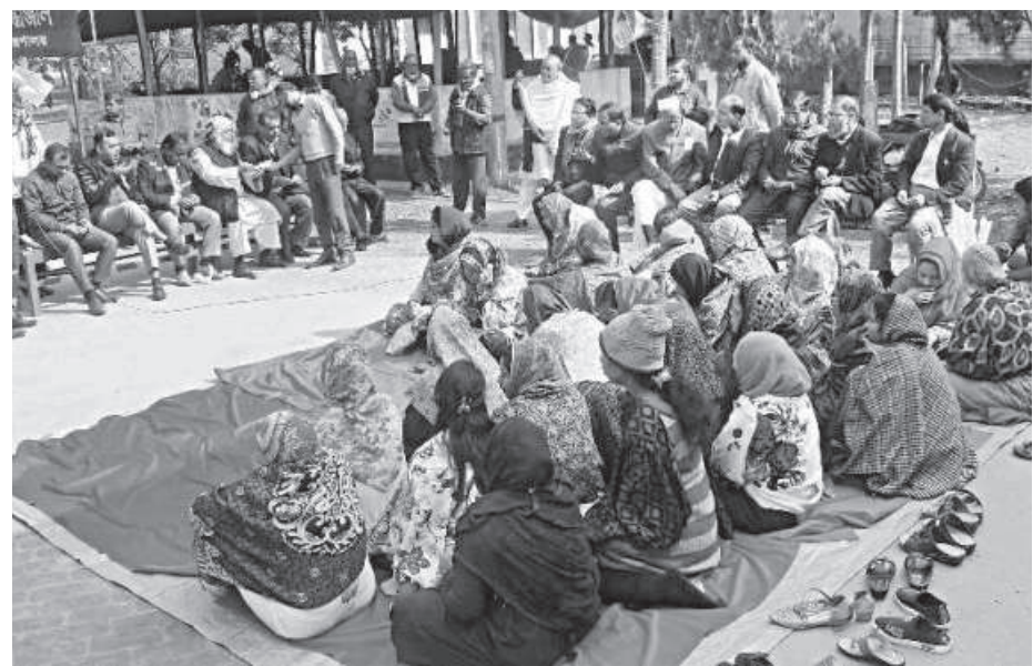
Agitating collectorate assistants in front of Tangail deputy commissioner's office yesterday.