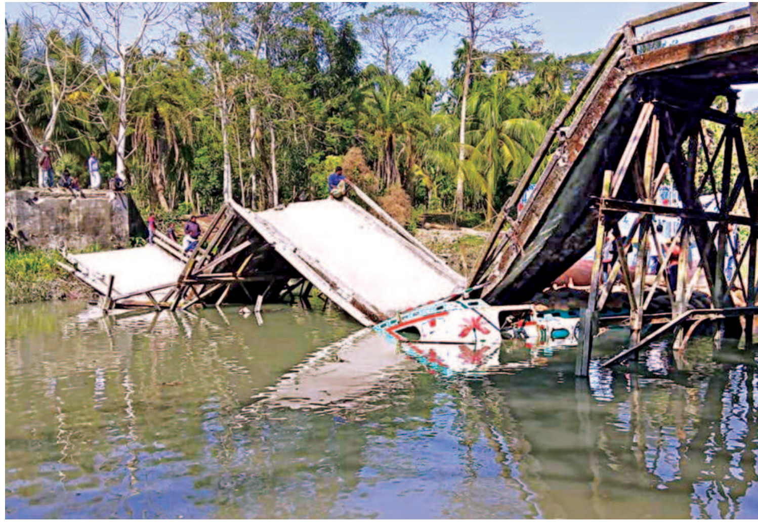
A sinking paddy-laden trawler that hit an iron bridge, causing it to collapse, in Domrabad-Hosnabad area of Patuakhali's Mirzaganj upazila on Tuesday. The accident has caused disruption to road communications between Patuakhali's Mirzaganj and Barguna's Betagi upazila and waterways communications between Jhalakathi and Khulna districts.