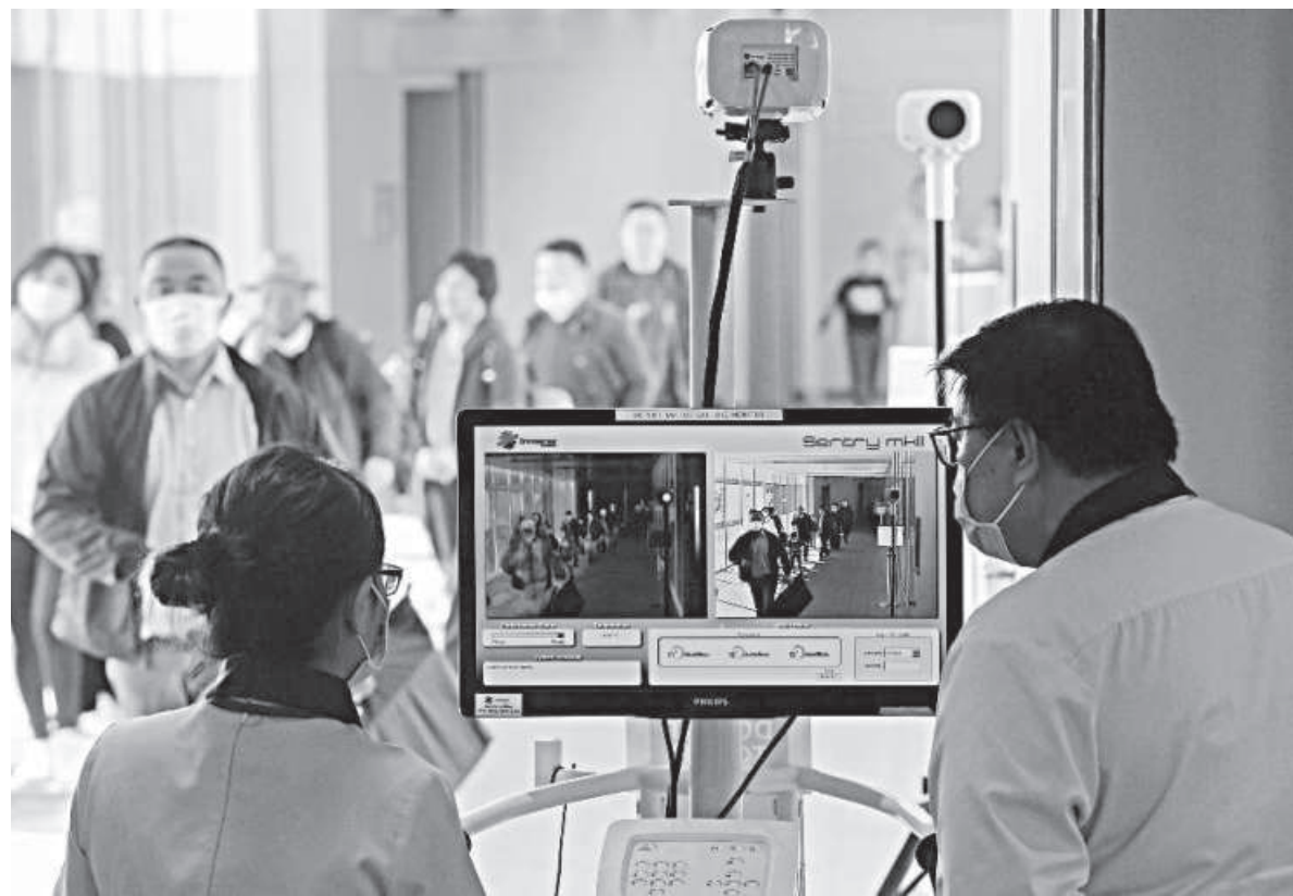
Health officers screen arriving passengers from China with thermal scanners at Changi International airport in Singapore yesterday as authorities increased measure against coronavirus.

The bodies of the victims were sent to Sir Salimullah Medical College morgue for autopsies.