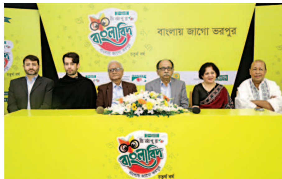
Guests, patrons and organisers at the press conference.

Even though Razzak passed away in August 21, 2017, his legacy as one of the greatest names in Bangladesh's film industry still inspires millions today.