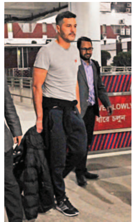
Former Brazil goalkeeper Julio Cesar arrived in Dhaka yesterday for the Bangabandhu Gold Cup.

The 40-year-old will have a busy schedule today as he would start his official tour with a visit to Dhanmondi Road No.32 to pay homage to Bangabandhu Sheikh Mujibur Rahman before heading to the BFF headquarters, where he would join training of women's football and have a session with the country's young goalkeepers.