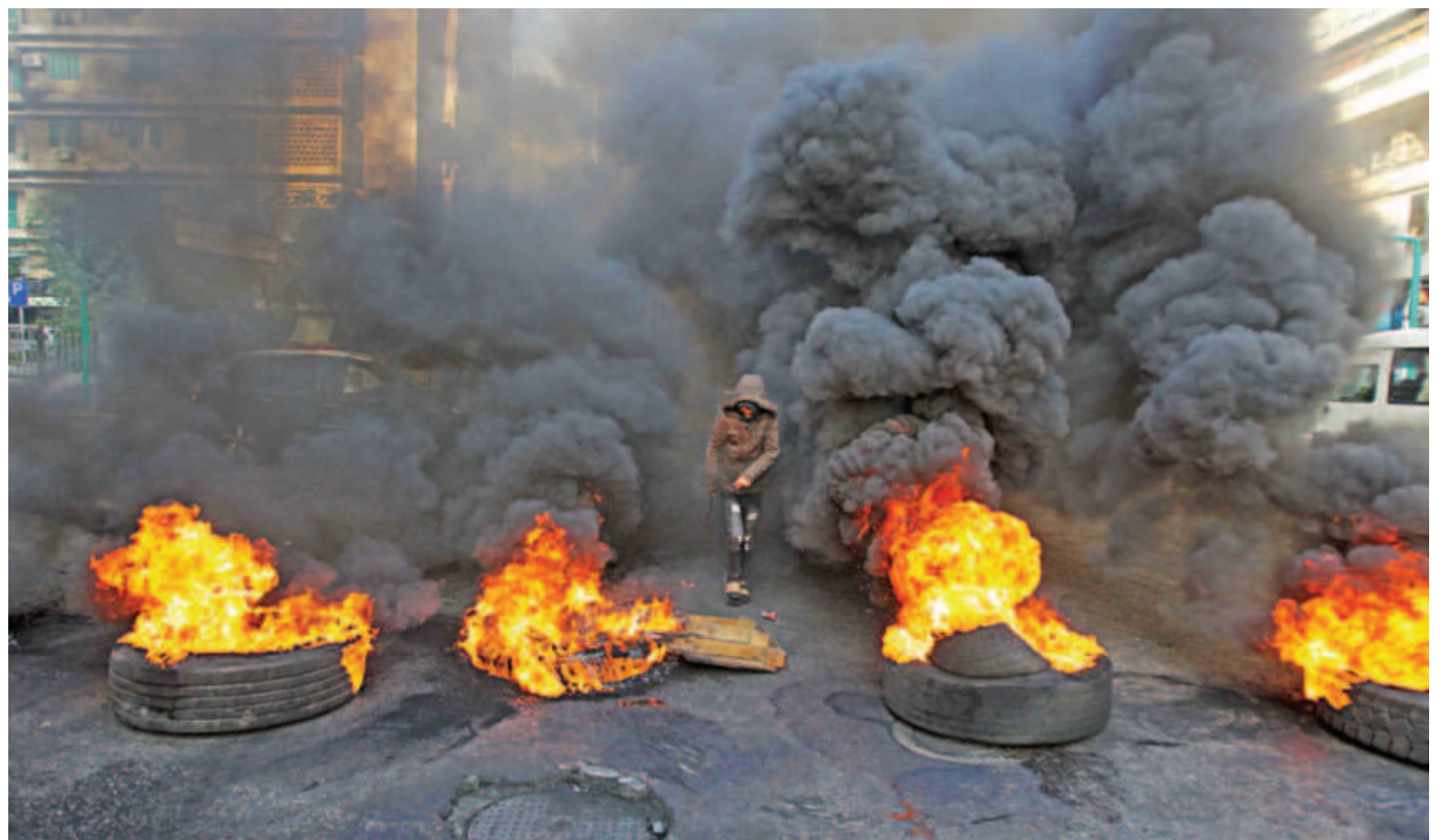
A protester walks through the smoke of burning tyres in the capital Beirut, yesterday. Lebanon ended a painful wait by unveiling a new cabinet line-up, but the government was promptly scorned by protesters and faces the Herculean task of saving a collapsing economy.