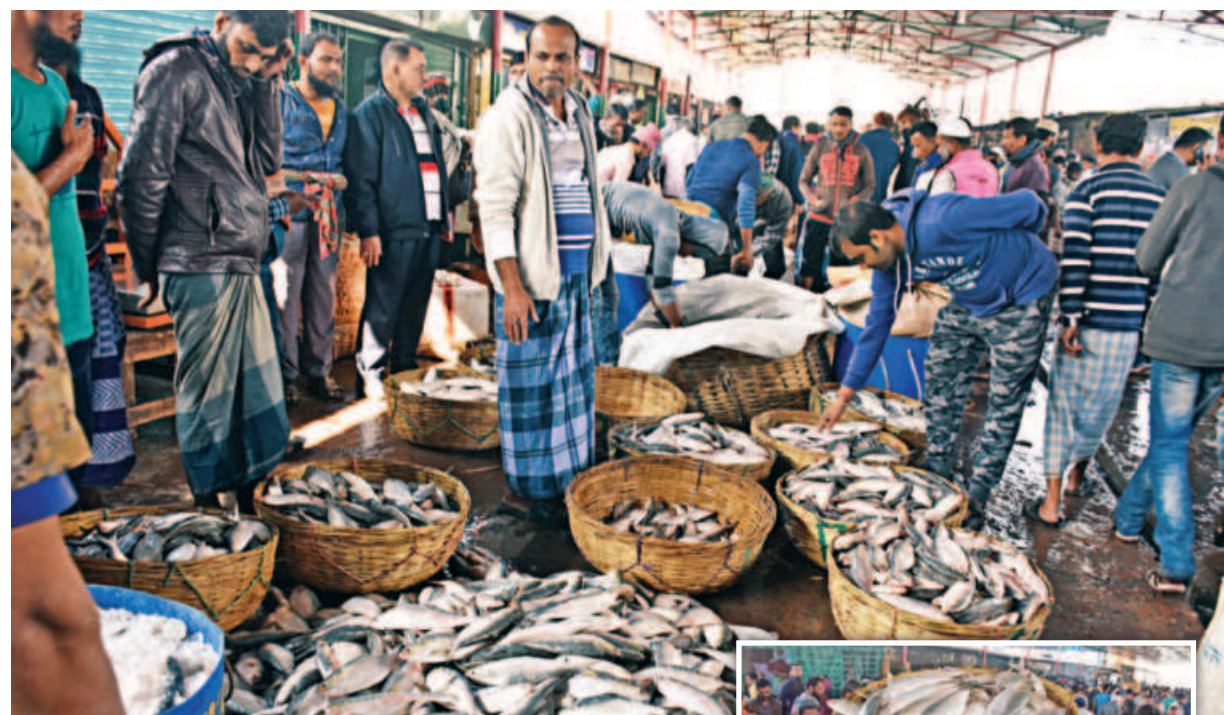
HILSA IN ABUNDANCE... With fishers bringing their prized catches to the markets and buyers busy negotiating, Barishal markets are buzzing with activities these days. Although winter is usually an off-season for the popular fish, huge shoals of hilsa are being netted by fishermen from different rivers of the division. The photos were taken at Port Road market in the city.