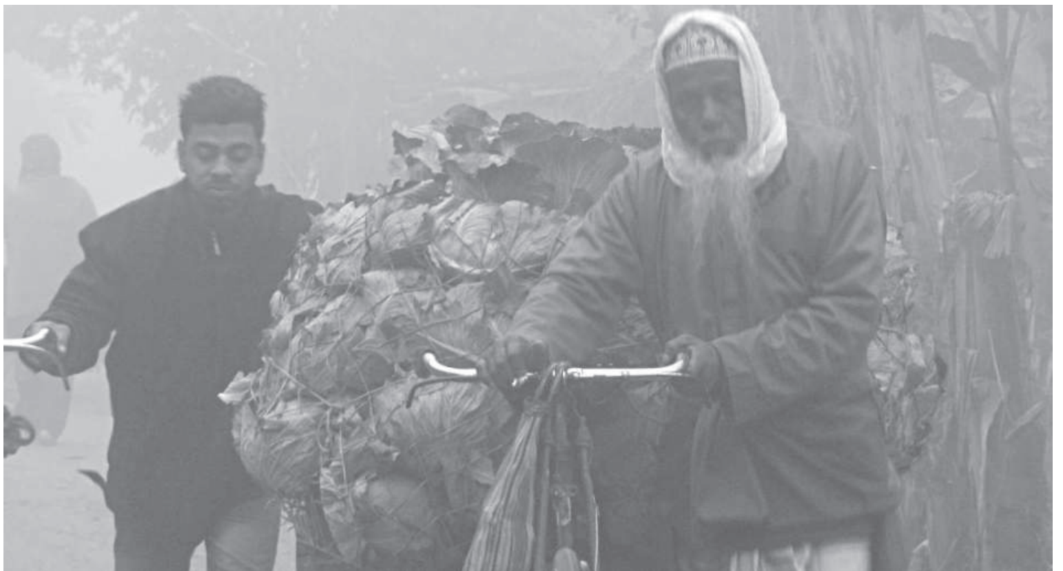
Braving bone-chilling cold and thick fog, an elderly farmer carries his produce to a kitchen market in Phulgachh village of Lalmonirhat Sadar upazila. The photo was taken yesterday morning.

Contacted, Lalmonirhat Deputy Commissioner Abu Jafor claimed that there is not much demand for free blankets in the district as the people there have become more "self-reliant". "At the beginning of the winter, we distributed around 4,000 blankets. There is no more demand now."