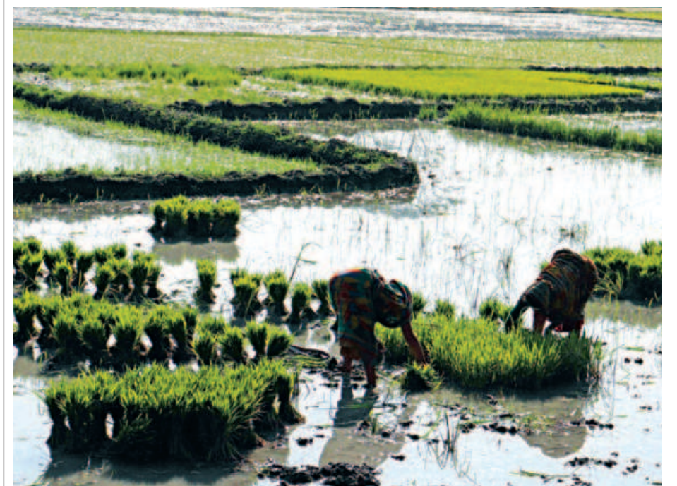
Seedlings are being sorted out by two female workers at a seedbed in Jujkhola village of Pirojpur Sadar upazila recently. It has been a long tradition in parts of the upazila and its neighbouring Najirpur upazila where women, after finishing their household chores, work alongside men at crop fields.