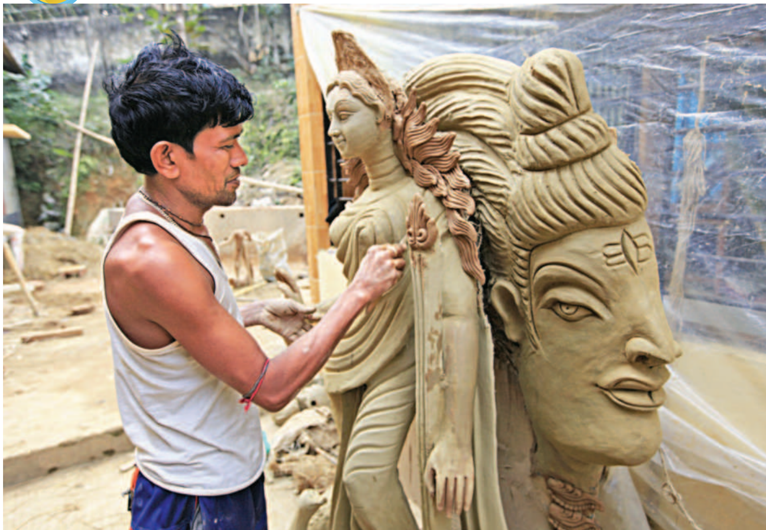
An artisan puts final touches on the idol of Saraswati, Hindu goddess of knowledge, insight and wisdom, as preparations for the puja are going in full swing in Sylhet. This year's Saraswati Puja, which is on January 30, will be held in around 300 places in the city with throngs of people participating. The photo was taken in Tilagarh area yesterday.