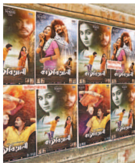
'Kathbirali' has received a lukewarm response at Ananda Cinema Hall.

Seats are limited and available on a first-come first-serve basis.