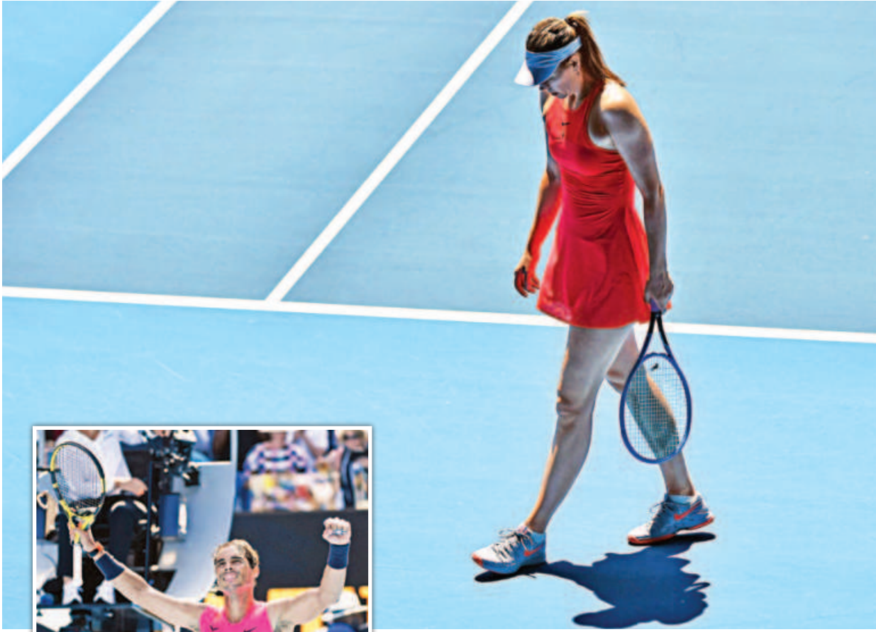
Former champion Maria Sharapova of Russia looks down and out during her first-round defeat against Donna Vekic of Croatia in the Australian Open in Melbourne on Tuesday. (Inset) World No. 1 Rafael Nadal of Spain, however, was in best of forms as he dispatched Hugo Dellien of Bolivia in straight sets to book a second-round berth.