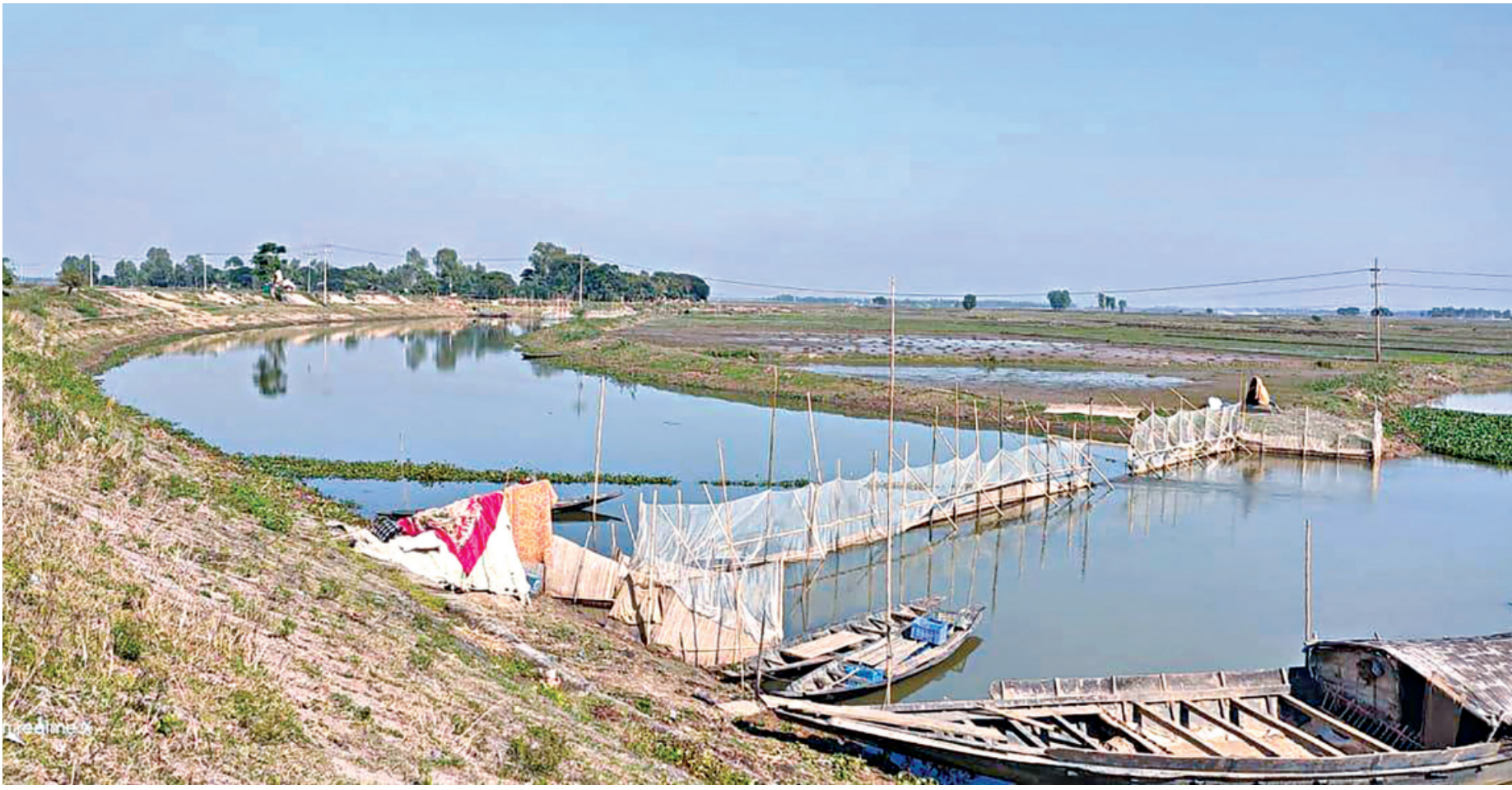
In plain view of everyone, the killing of fish, aquatic animals and insects goes on in the beautiful Ratna river. The makeshift sheds on both sides of the river are used by guards to protect the catch in the fishing net, set across the river, and the docked boats are used to transport the catch. A few hundred feet away, just past the curve, a similar structure can be seen in the river. Such illegal structures have been placed across the Ratna and Shutki rivers in at least 20 places of Baniachong upazila under Habiganj, alleged locals. The photo of the river was taken nine kilometres away from the upazila headquarters.