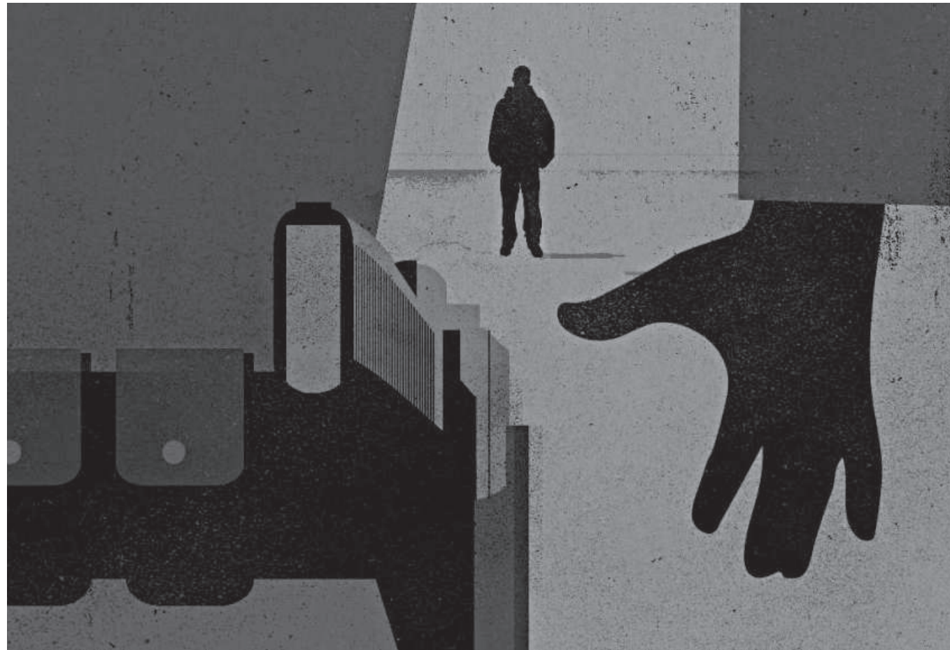
ILLUSTRATION: WOODY HARRINGTON

Increasing violence, changing patterns of crime, use of more sophisticated weapons in crime and the general atmosphere of insecurity demands a review of the provisions of law to empower the police to effectively deal with lawless activities. We have to (a) free the police from the clutches of extraneous forces; (b) make the police accountable to people and law; (c) improve police credibility by reposing more trust in their depositions, at least at the assistant superintendent level; (d) raise their status to make them trustworthy in the eyes of the citizen; and (e) regulate police behaviour through internal controls