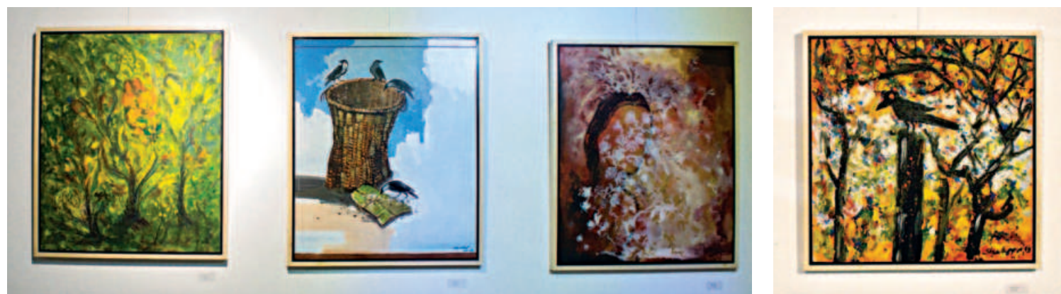
Artworks on exhibit at the event.