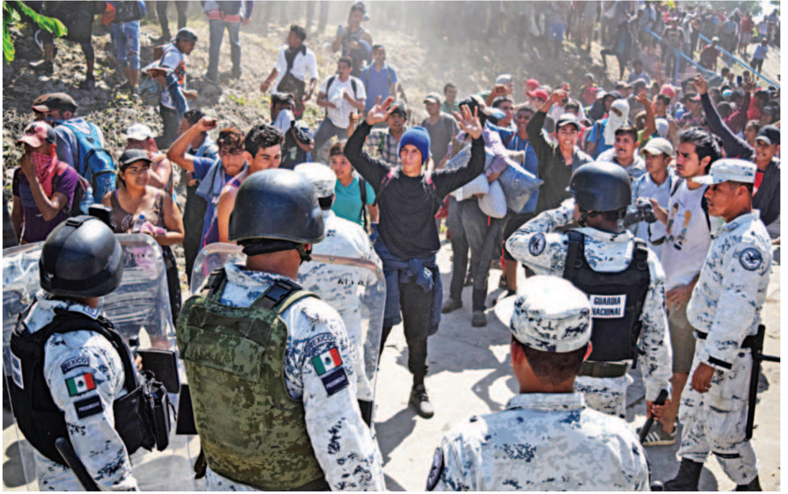
Members of Mexico's National Guard hold their shields to block migrants, part of a caravan travelling to the US, near the border between Guatemala and Mexico, in Ciudad Hidalgo, Mexico, on Monday. Forces fired tear gas at rock-hurling Central American migrants who waded across a river into Mexico, in a chaotic scramble that saw mothers separated from their young children.

"China, for instance, has pioneered eco-industrial parks where the waste of one business becomes the feedstock for another."