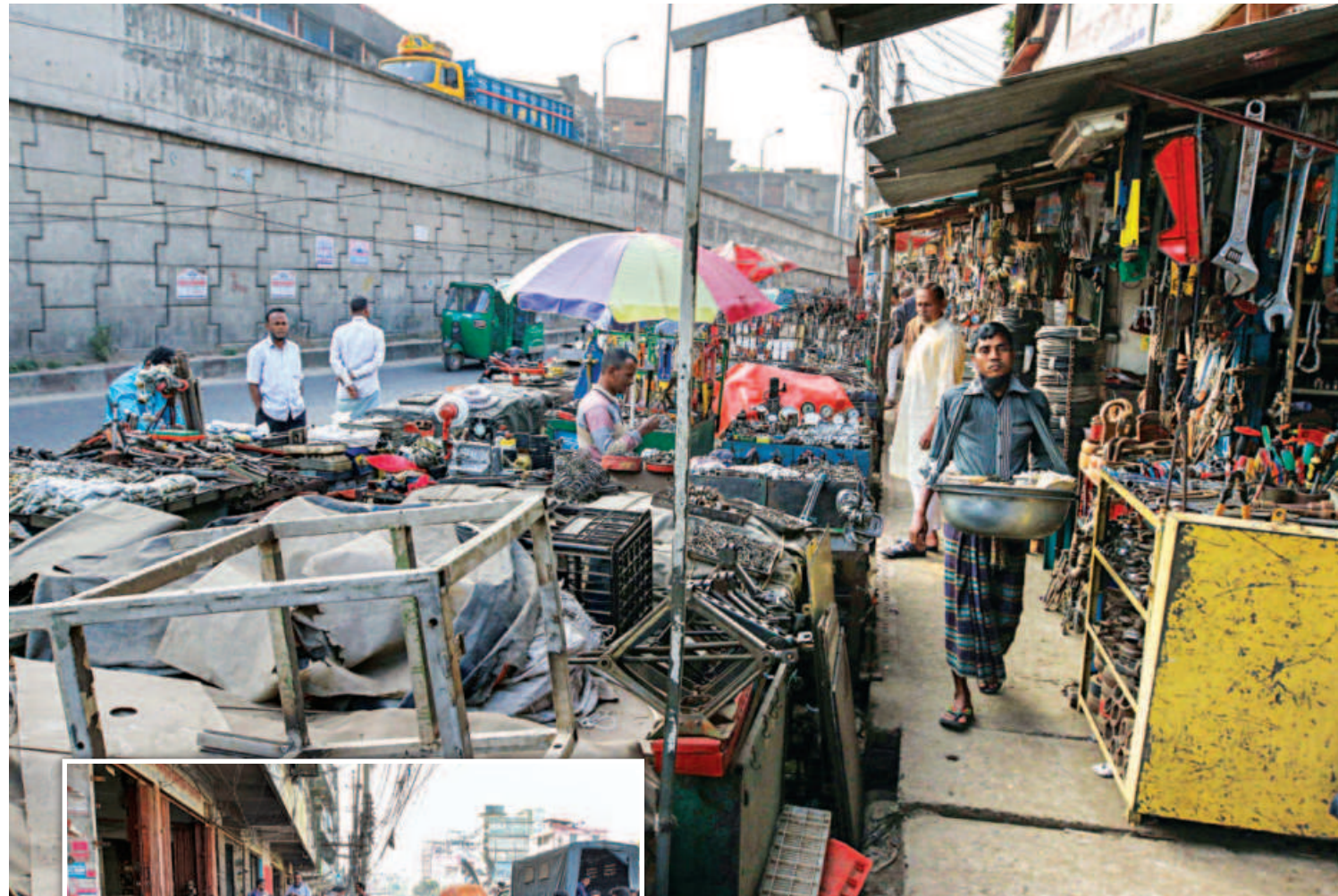
Traders have set up temporary shops on the footpath and part of DT Road in Chattogram city's Kadamtali area, obstructing the movement of traffic and pedestrians. Such occupation of footpaths often causes tailbacks. Inset, traders with permanent shops have piled up their products on the footpath.