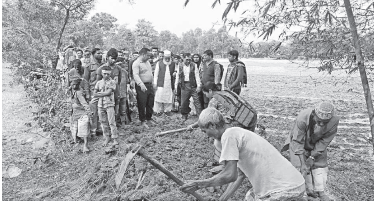
People of all ages join hands to repair this three kilometre road in Lengura union in Netrakona's Kalmakanda upazila yesterday. They took the initiative after repeated appeals to the authorities concerned fell on deaf ears.

According to DAE officials, 25,030 hectares of land has been brought under potato cultivation against the target of 23,528 hectares in Thakurgaon this season while 9,920 hectares has been cultivated against the target of 8,531 hectares in Panchagarh.