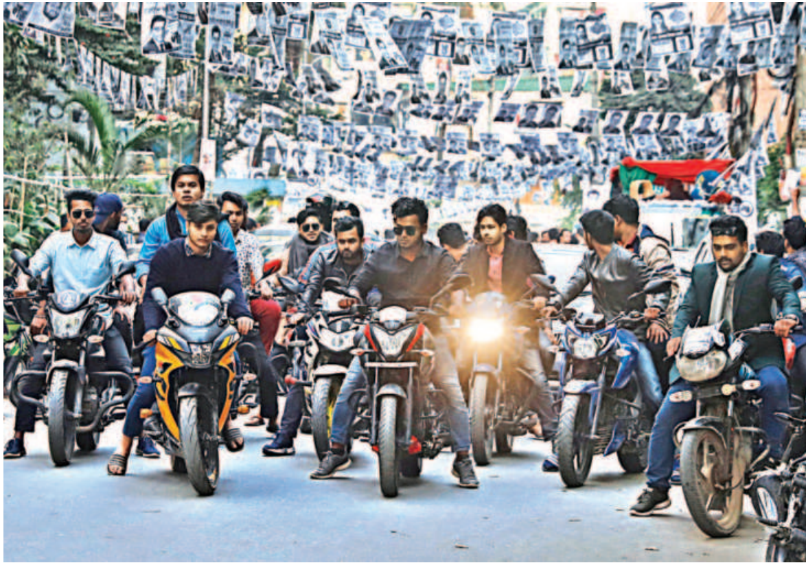
Traffic rules are for everyone, unless you are part of this biker gang rallying for the Awami League mayoral candidate -- evident from stickers on the motorcycles. This group was seen blocking an entire road in Segunbagicha yesterday, parading through without helmets.