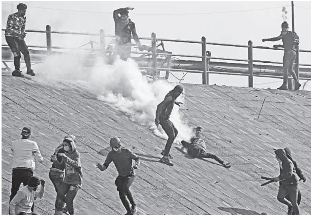
An Iraqi protester falls down after being hit by a tear gas canister amid clashes with riot police on Mohammad al-Qasim highway in east Baghdad, yesterday. An Iraqi protester was killed yesterday in Baghdad, medics said, where angry youth have reignited their anti-government protest movement by shutting roads to pressure authorities to implement long-awaited reforms.