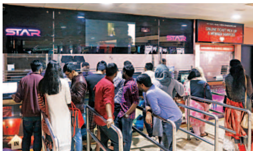
At Star Cineplex in Bashundhara City, the crowd for 'Kathbirali' mainly consisted of youngsters.