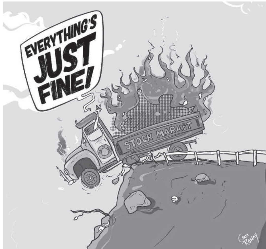
ILLUSTRATION: EHSANUR RAZA RONNY

There are also other reasons behind foreign investors selling their shares. After communicating with many of them over email, I found that most of them are unhappy with political interference in the market and with regard to various economic issues in Bangladesh. At the end of last year, the Bangladesh Securities and Exchange Commission (BSEC) suddenly increased the tenure of the mutual funds from 10 to 20 years. At a time when investors are waiting for the fund to mature within