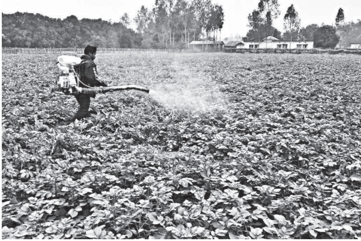
A farm worker sprays pesticide in a potato field at Yakubpur village in Thakurgaon Sadar upazila, in an attempt to minimise the effect of late blight disease.