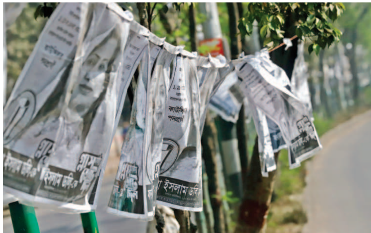
With the Dhaka city polls only nine days away, most of the city streets and alleys have been flooded with posters of mayor and councillor candidates. Laminated with non-biodegradable plastic, these posters pose a serious threat to environment. The photo was taken in the city's Khilgaon area yesterday.