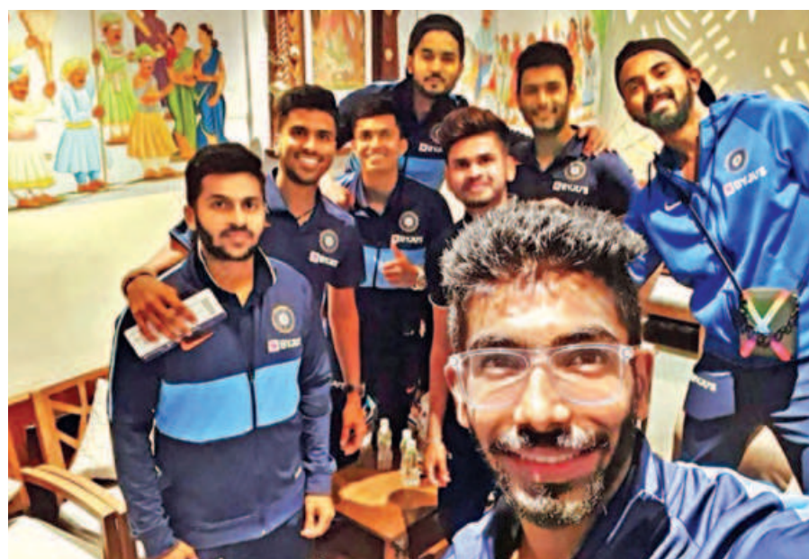
Indian cricketers pose for a selfie prior to their departure for New Zealand yesterday. They will play a five-match T20I series from January 24 followed by a three-match ODI series.