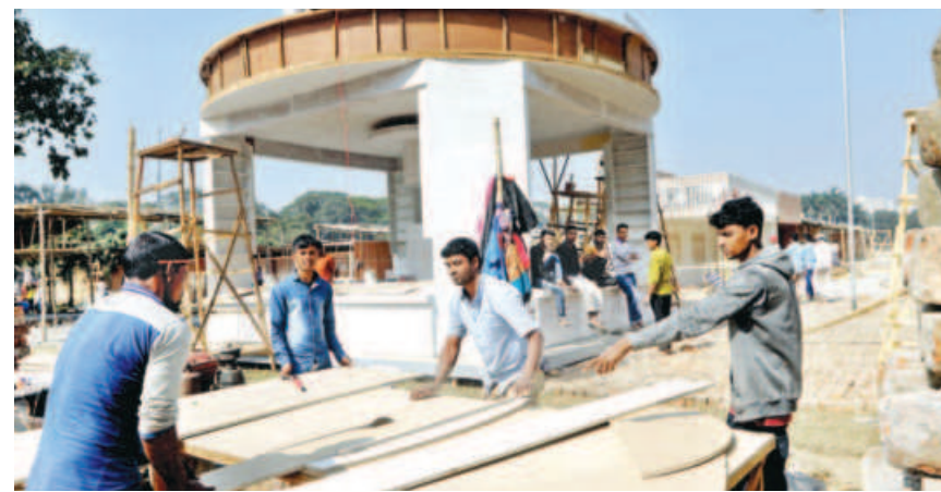
Workers set up a pavilion for Amar Ekushey book fair in Suhrawardy Udyan yesterday.