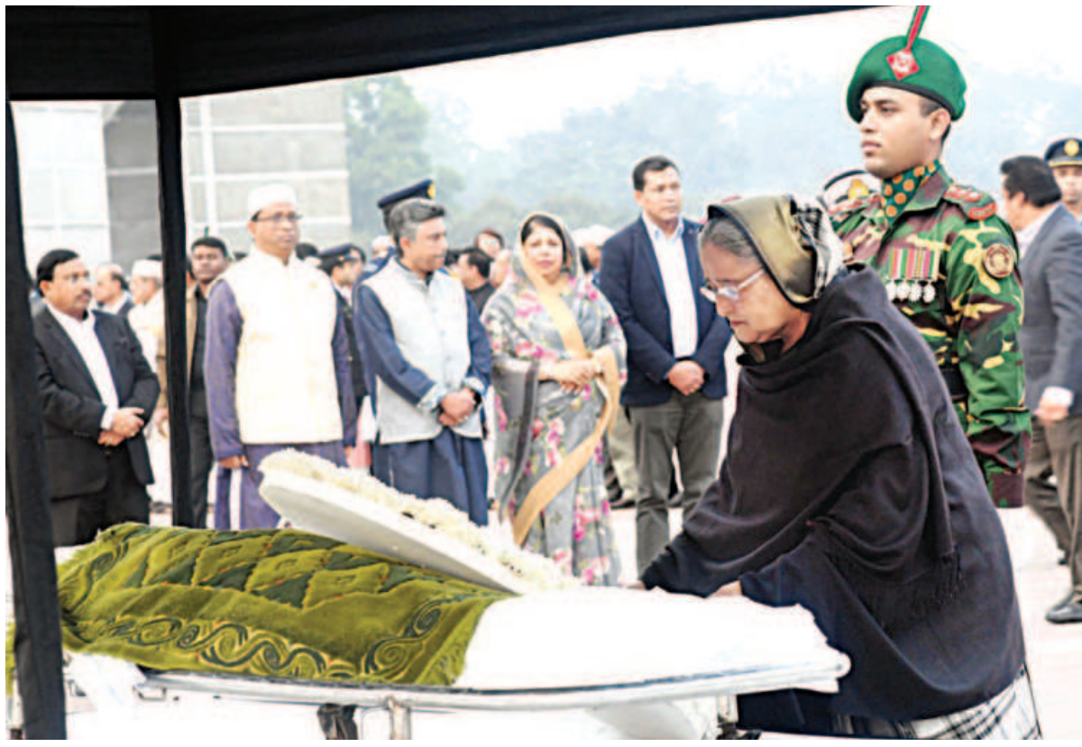
Prime Minister Sheikh Hasina places a wreath at the coffin of Awami League lawmaker Ismat Ara Sadique at the South Plaza of the Jatiya Sangsad Bhavan yesterday. The 78-year-old lawmaker passed away at a city hospital earlier in the day.

The Daily Star obtained copies of the letters.