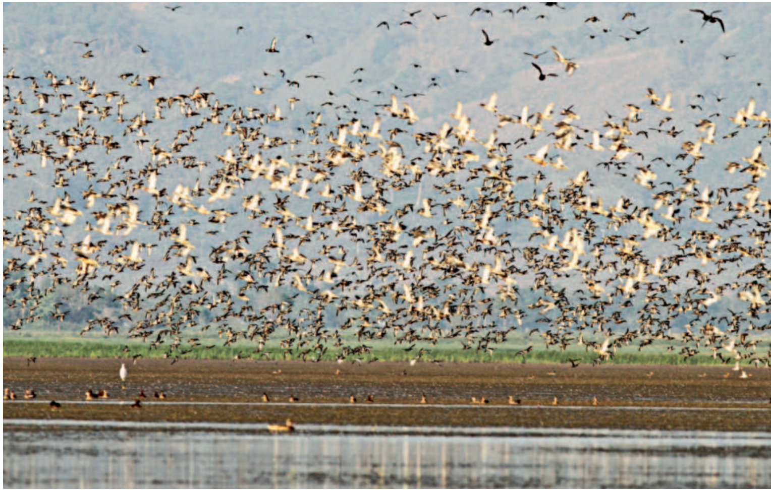
A huge flock of migratory birds fly over one of the many waterbodies in Sunamganj's Tanguar Haor. Birds of several rarely-seen species visit the area around this time of the year.

The following morning, Rokeya went to the room around 7am and saw its furniture and belongings scattered, while a window grille was broken. The family suspects miscreants may have entered by cutting the grille.