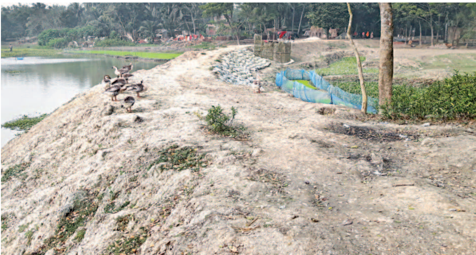
Embankment built at the mouth of Sonalidanga canal in Jhenidah's Kaliganj upazila impedes flowing down of water from the adjacent Majdia beel, eventually inundating a large area of croplands in the area.

Contacted, Kaliganj Upazila Nirbahi Officer Subarna Rani Shaha said she will take action if the stakeholders approach her.