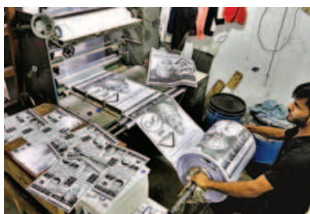
A worker laminating posters at a printing press in the capital's Arambagh area.

Therefore, the posters will be in the dumping grounds for years only to add to environment pollution, they said,