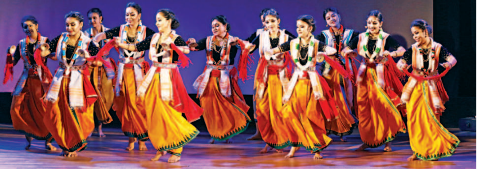
Artistes of Chhayanaut perform at the event.