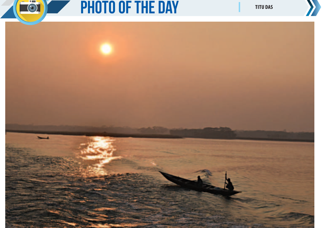
As the sun sets over Meghna, fishermen bring out their small boats and set sail against the currents of the river.

freedom fighter certificates when they applied for the job. Judge Manzurul Islam ordered them to be sent to jail, after they were