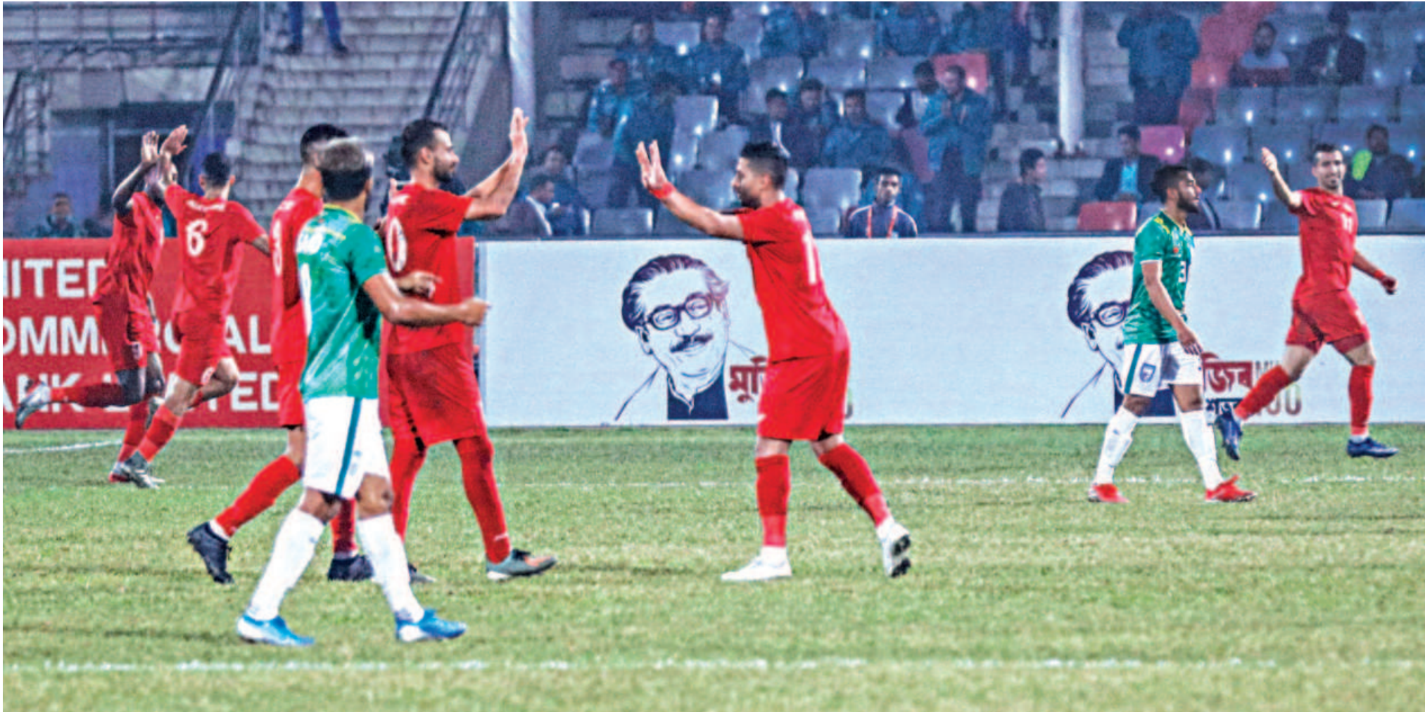
Palestine players celebrate one of their two goals against Bangladesh in the opening match of the Bangabandhu Gold Cup at the Bangabandhu National Stadium yesterday.