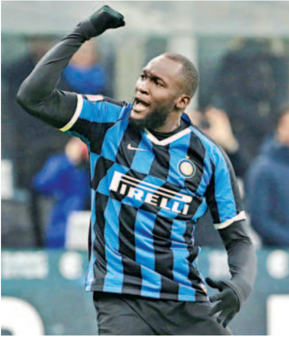
Inter Milan's Belgian forward Romelu Lukaku celebrates after opening the scoring in just 21 seconds during their Italian Cup Round of 16 match against Cagliari at San Siro in Milan on Tuesday.