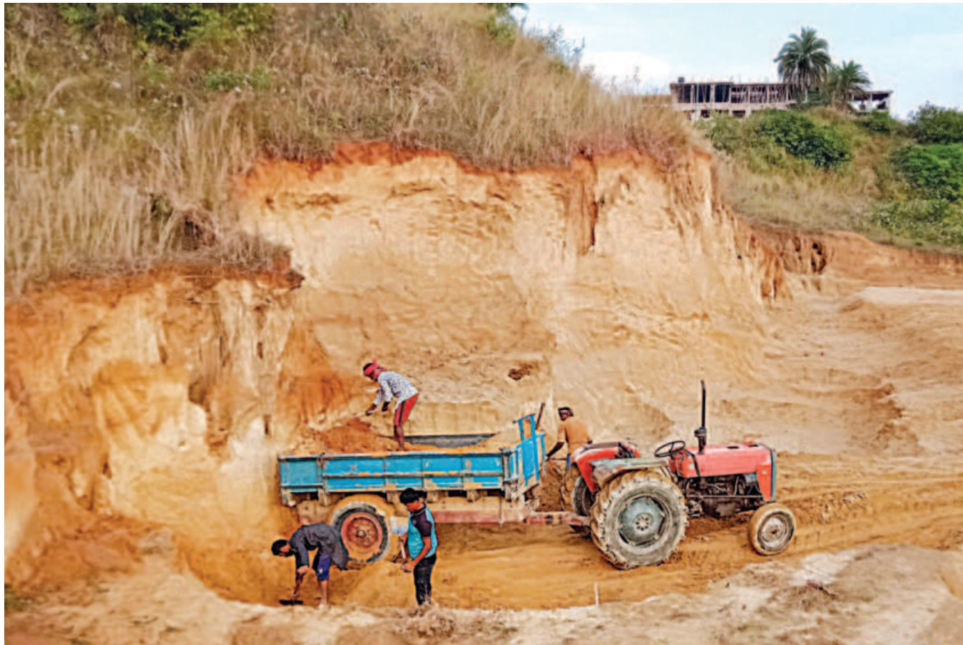
Workers cutting a hill and loading soil onto a tractor trailer at Cumilla University. The Department of Environment says the university is implementing a project in the area to expand its central playground without environmental clearance. The photo was taken last week.