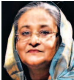
SEE PAGE 10 COL 5

She stressed the need for carrying out campaigns in villages so that overseas jobseekers do not fall victims to deception of middlemen and no