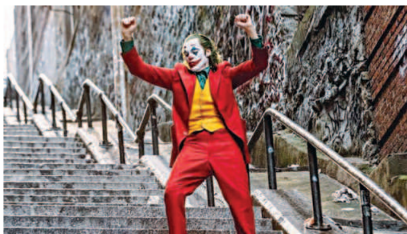
Joaquin Phoenix in 'Joker'.