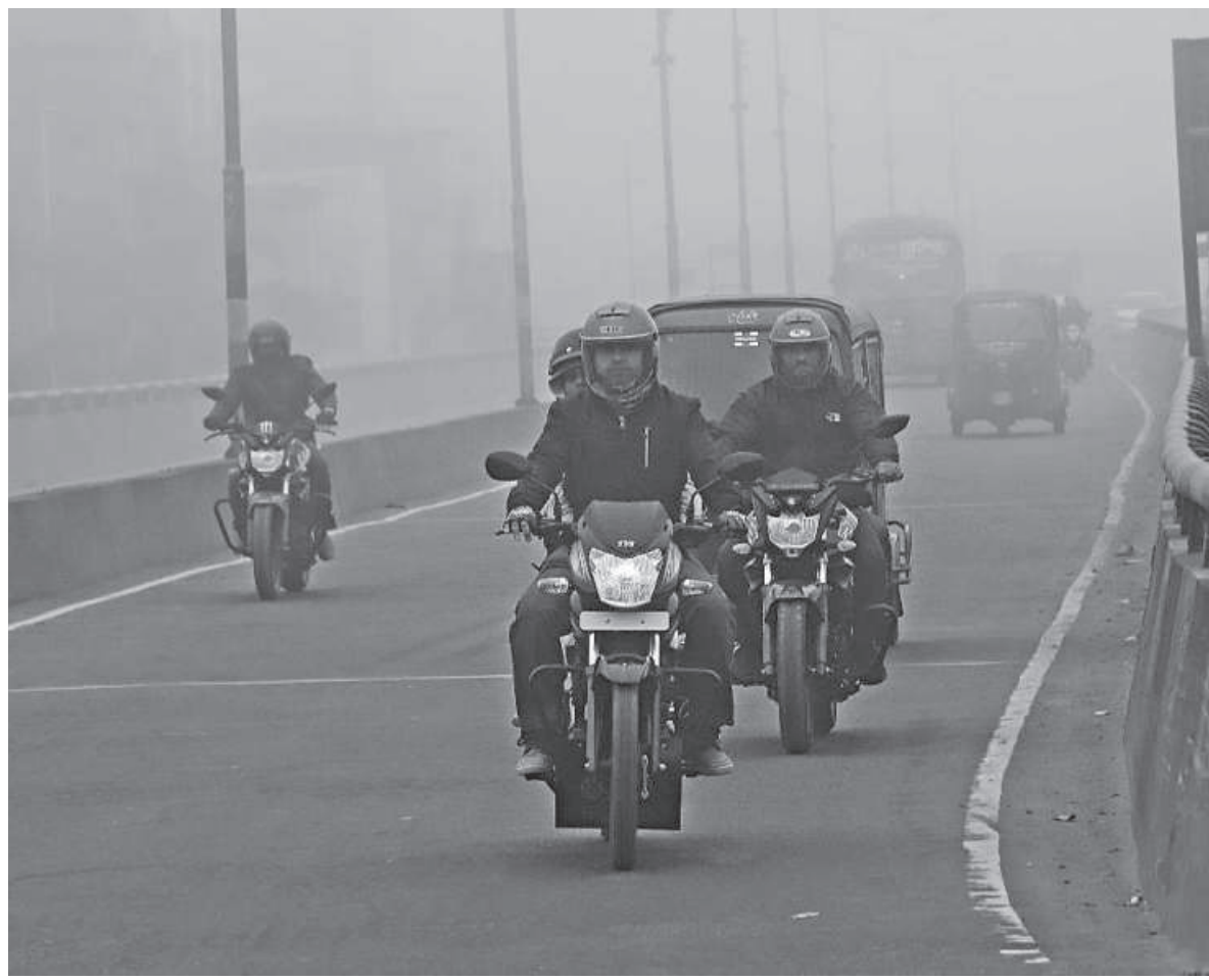
Dense fog blanketed the capital for most of yesterday morning, often impeding visibility of drivers on the road. This photo was taken on Khilgaon flyover around 9am.

The CID is investigating four money laundering cases against them.