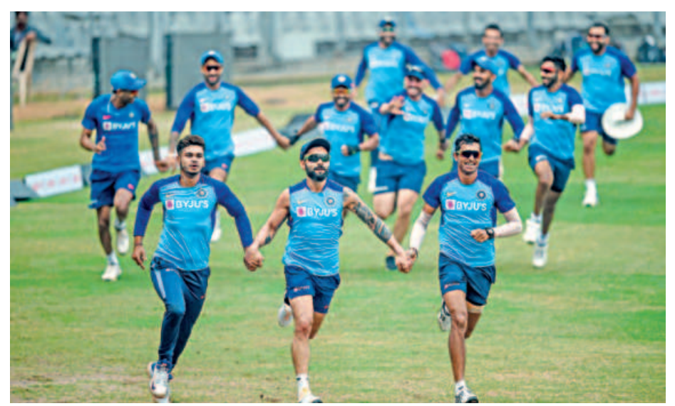
India players led by skipper Virat Kohli (C) run holding hands during a training session ahead of the first ODI against Australia in Mumbai yesterday.

penultimate over, but the skipper returned to his wicketkeeping duties after the exchange. For Rajshahi, Mohammad Irfan remained the most impressive bowler, returning figures of two for 13.